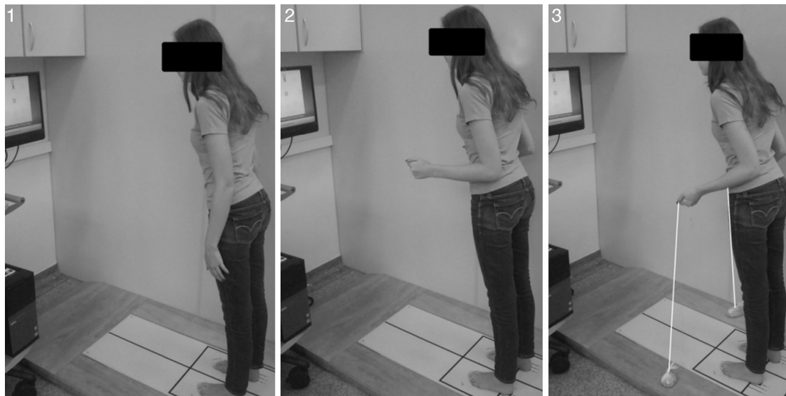
Figure 2 Positions adopted during evaluations using the Balance Master® equipment. Position 1, standing with the arms along the body; position 2, standing with the elbows bent at 90° (simulating holding the anchors); and position 3, with elbows bent at 90° holding the anchors.

stability limit previously calculated by the machine, based on the individual's height. In this study, the points were established and represented by the numbers 1 (anterior), 3 (left lateral), 5 (posterior), and 7 (right lateral) to represent COP displacement in the anterior–posterior and medial–lateral directions.