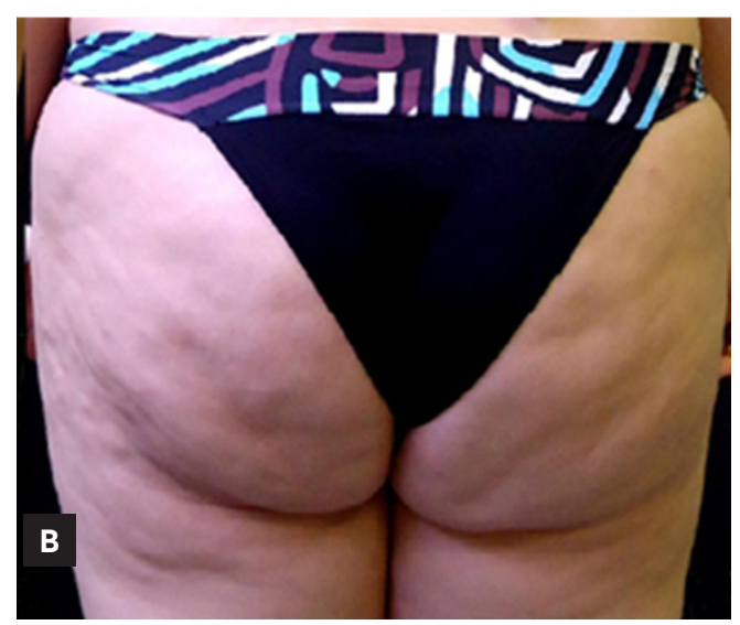
Figure 2. Gluteal region without contraction (A) and with contraction (B).

Descriptive analysis was performed from absolute and percent frequencies, and measures of centrality and dispersion. The correlation among variables was checked with the Pearson correlation test and the significance level adopted was 5%.