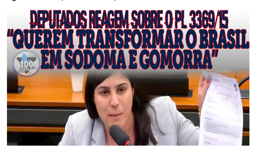
Figure 6: Screen capture of the video posted on the Política 100 Censura YouTube channel

At the end of the meeting, counting those lawmakers who exercised their right to speak as members or substitutes on the commission, leaders of parties or coalitions, four deputies declared support for the bill while another seven attacked the text. Initially, then, we can classify this polarization as a historic clash between deputies linked to the left of the political spectrum and parliamentarians positioned to the right. Taking into account the content involved in the debate, this confrontation can be analysed as conservative versus progressive.