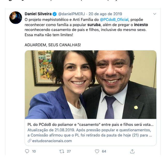
Figure 5: Screen capture of the post on Deputy Daniel Silveira's Twitter profile

Despite the absence of the public, the meeting was attended by a large number of parliamentarians and quickly attained the quorum needed for it to start. With all the seats occupied, I had to accompany the session standing. Some commission positions are essential to understand how the work is organized. We can begin with the chair of the commission, occupied by the Workers' Party (PT) in the figure of Deputy Helder Salomão, elected from Espírito Santo state. According to the Chamber of Deputies' regulations, the presidencies of the commissions and the places allocated to members and substitutes are distributed among the coalitions and parties, with the largest of these enjoying advantages in the choice of presidencies and the number of seats.18 The vice-presidents of the commission are, first, Father João (PT/MG); second, Túlio Gadêlha (PDT<sup>19</sup>/PE); and third, Camilo Capiberibe (PSB/ AP). 11 of the 18 seats making up the commission were from the PSL/PP/PSD/MDB/PL/REPUBLICANOS/DEM/PSDB/ PTB/PSC/PMN coalition, four were taken by the PDT/PODE/SOLIDARIEDADE/ PCdoB/PATRIOTA/CIDADANIA/PROS/AVANTE/PV/DC coalition and three by the PT/PSB/PSOL/REDE coalition.