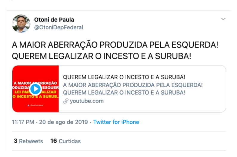
Figure 3: Post on the Twitter profile of Otoni de Paula (PSC/RJ)

The publication of this video on the YouTube channel of Otoni de Paula was linked in the post on the Rio deputy's Twitter profile, which contained the alert: THE BIGGEST ABERRATION PRODUCED BY THE LEFT! THEY WANT TO LEGALIZE INCEST AND ORGIES! This post was one of the elements that preceded a turbulent ordinary deliberative meeting of the Chamber of Deputies Commission for Human Rights and Minorities.