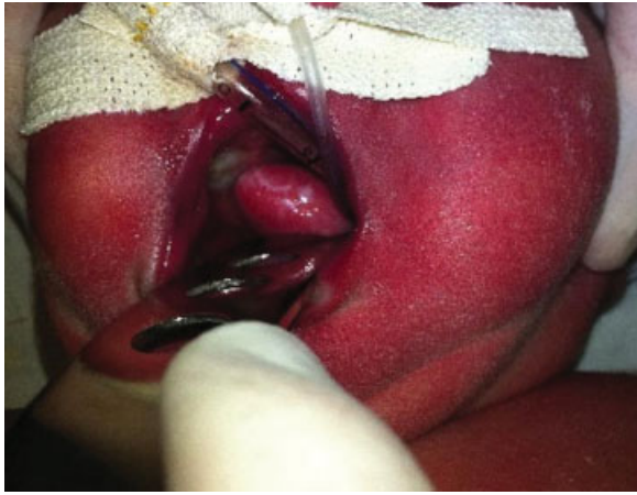
Fig. 1 Transoral view of the lesion.