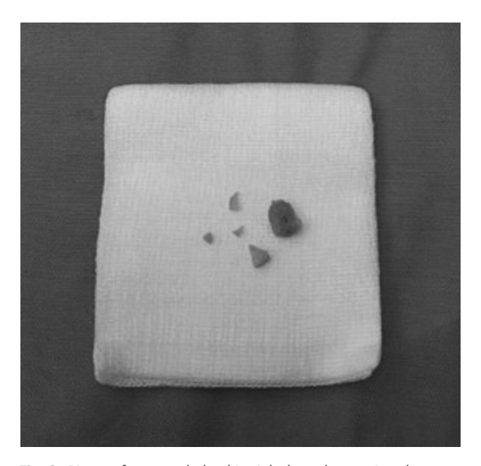
Fig. 2 Pieces of peanuts lodged in right bronchus retrieved.