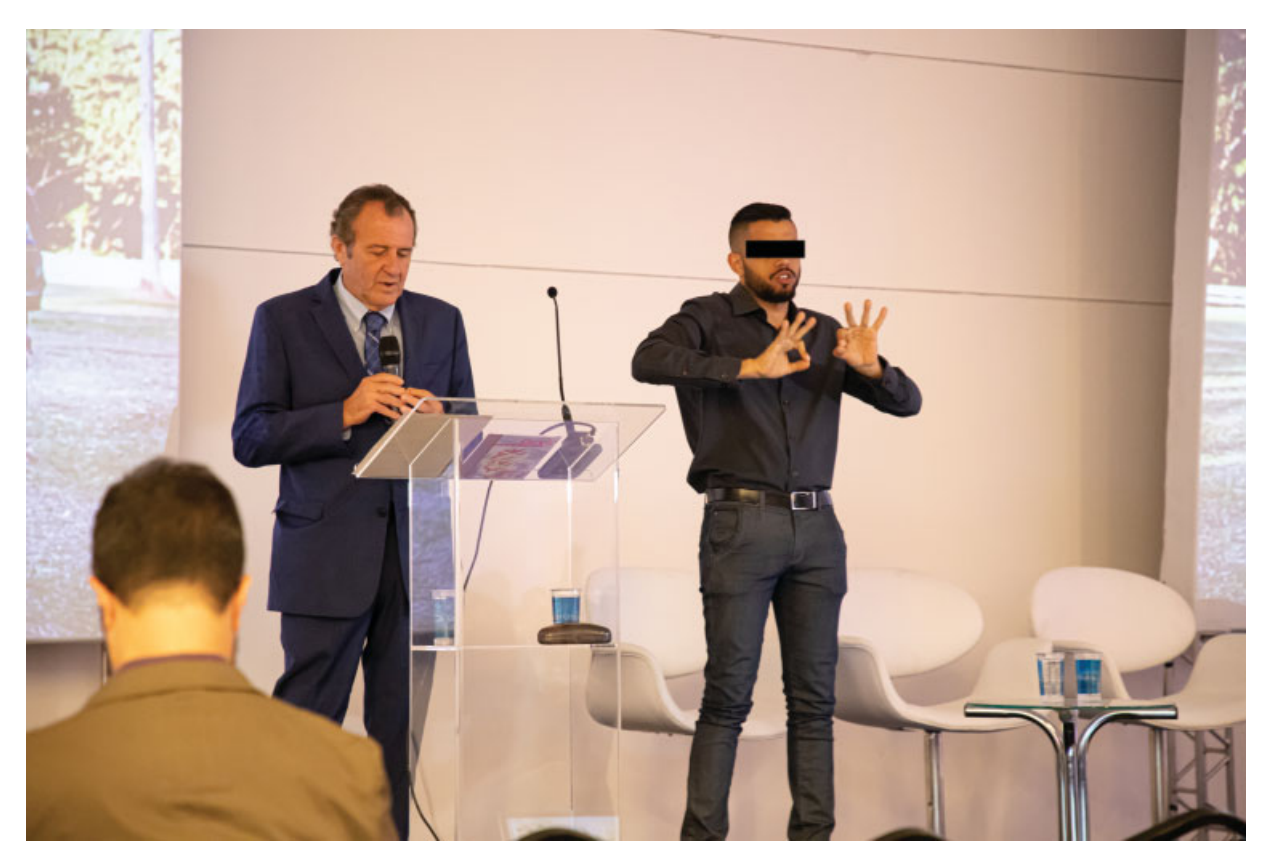
Fig. 6 An auction at the end of the Ear Parade Campaign.

At the end, an auction was held, and the money raised from selling the sculptures was granted for research on stem cells for hearing, in addition to donating batteries, hearing aids, and cochlear implants and improving the infrastructure for the otology sector of the Hospital das Clínicas ( Fig. 6 ). Approximately USD 72,000 were raised