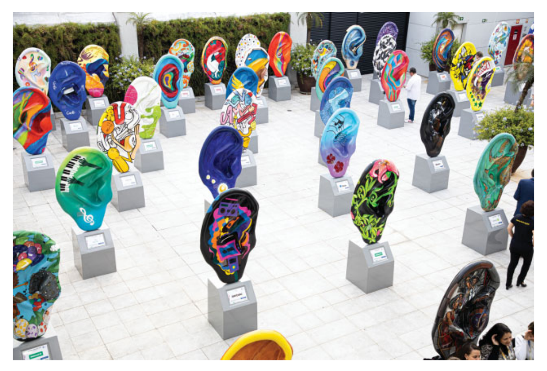
Fig. 2 Final exhibition of ears.