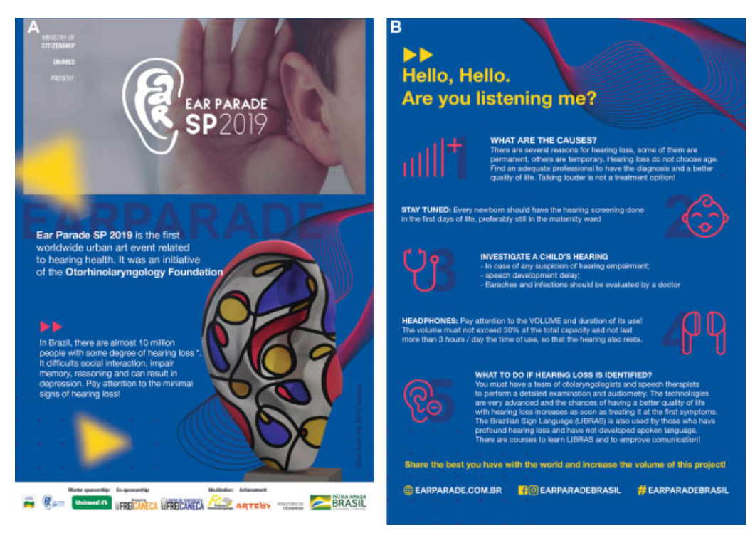
Fig. 1 An informative folder on preventive strategies against deafness.

The absence or substantial attenuation of auditory inputs to the brain alters neuronal connectivity and processing in