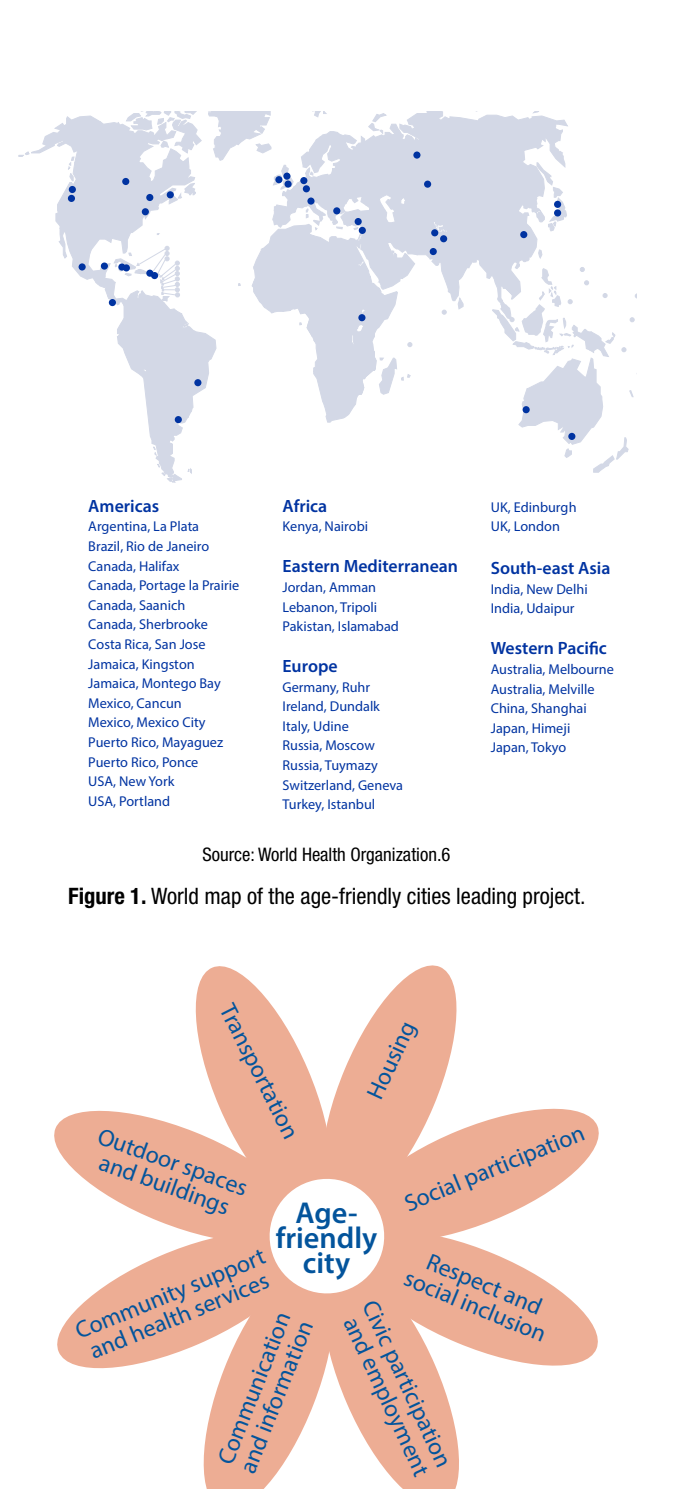
Figure 2. Age-friendly city domains for rating the cities all over the world.

The process begins with a commitment letter issued by the city applying for the seal. The proposed plan of the city for meeting the conditions for receiving the seal is followed up by the WHO or its representative in the region where the city is located. After a baseline assessment, strategies are drawn up and developed. An evaluation of the city is then carried out and the seal of an age-friendly city will be given, depending on the achievements and fulfillment of requirements for such certification. Figure 3 illustrates the step of the process to apply for the seal and to continue as a member of the age-friendly city program conducted by the WHO.