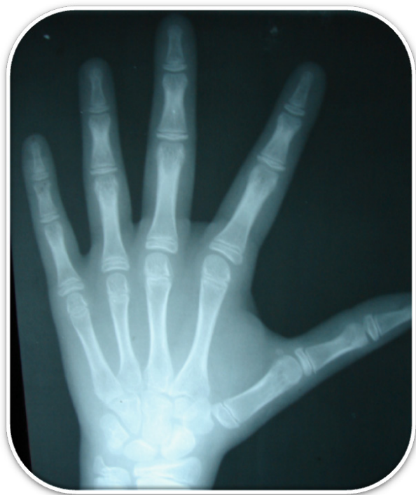
Fig. 1. Hand and fist radiography of an individual that was in SMI stage 8. The sesamoid bone is observed.