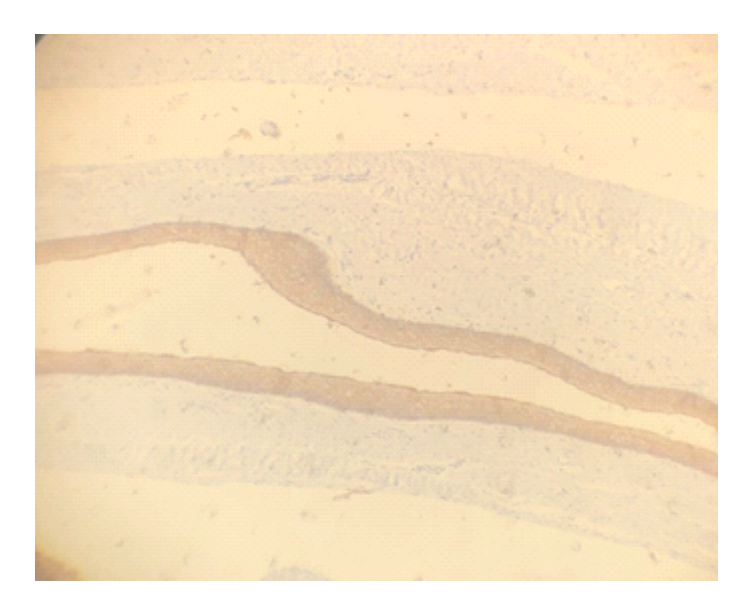
Figure 1. Immunohistochemistry aspect showing positivity of e-cadherin.