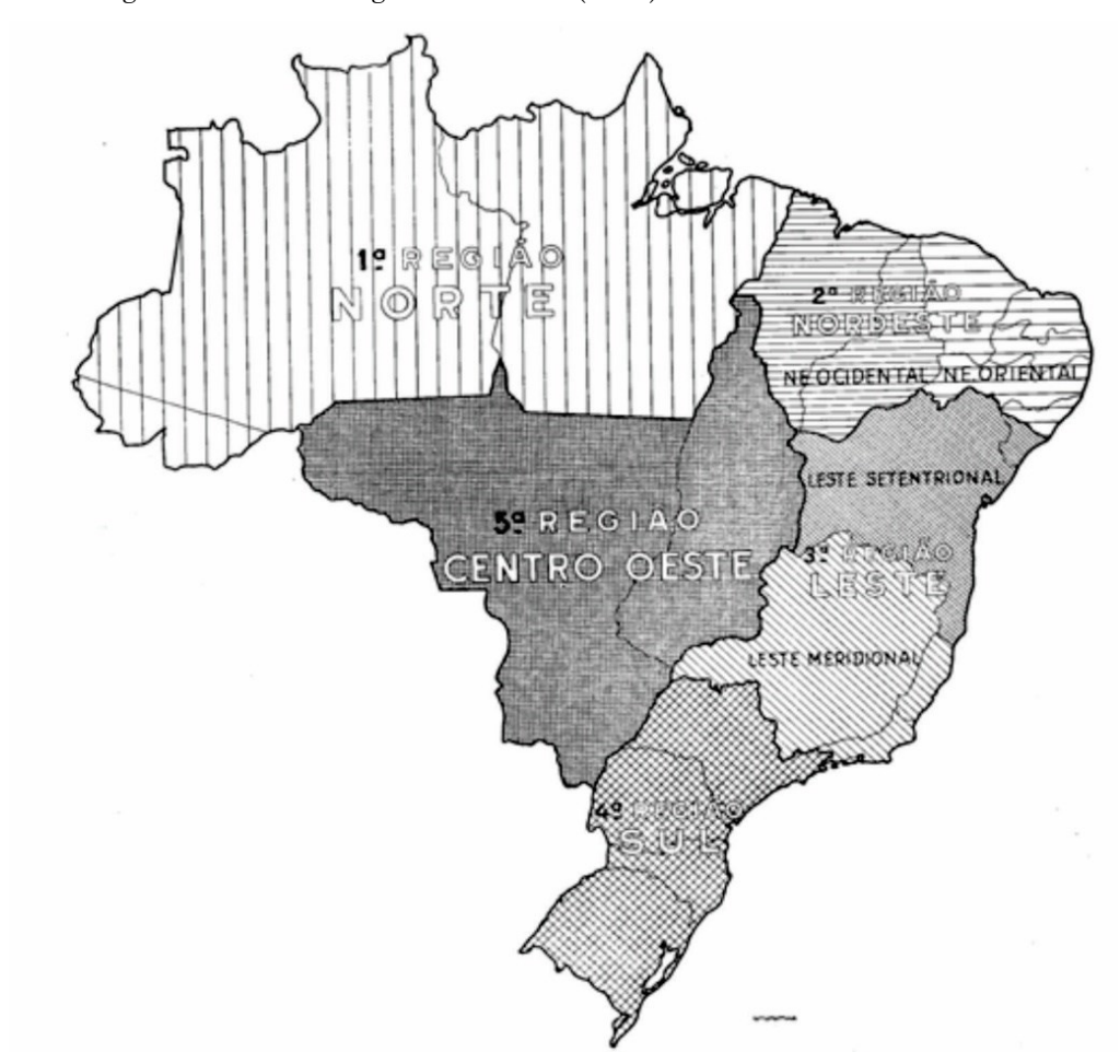
Figure 3 - Cartogram of Brazil's regional division (1941).

to resolve problems of regional limits permeating environmental units. This way, sub-dividing two of the major economic centers of that period (Minas Gerais e Rio de Janeiro) from the States of Bahia e Sergipe, provided a way to relieve the social inequality present in that region.