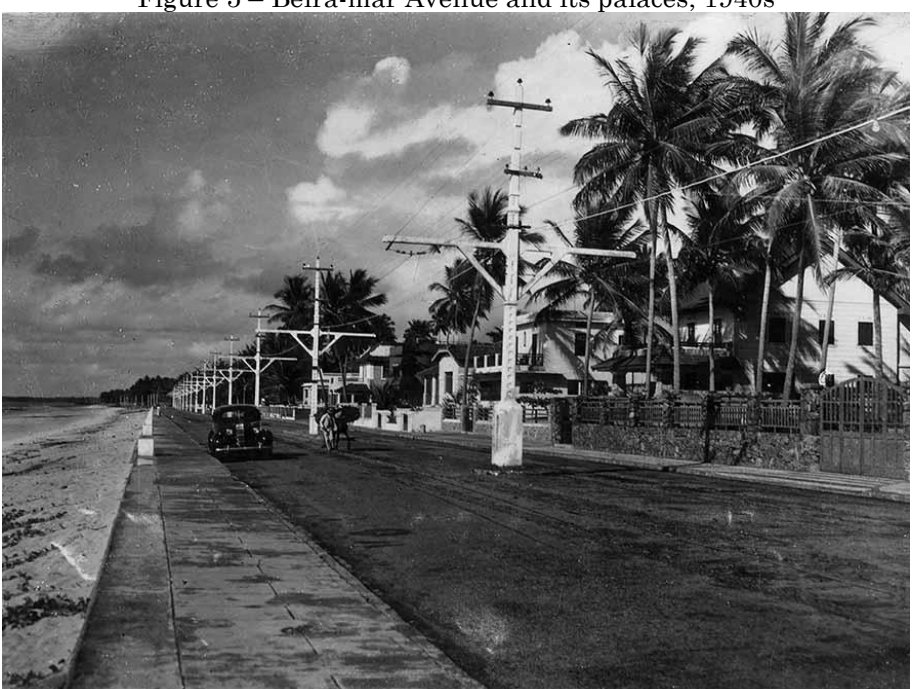
Figure 5 – Beira-mar Avenue and its palaces, 1940s

residences. In the 1930s and 1940s, they had already taken place on almost all the coastline (Figure 5).