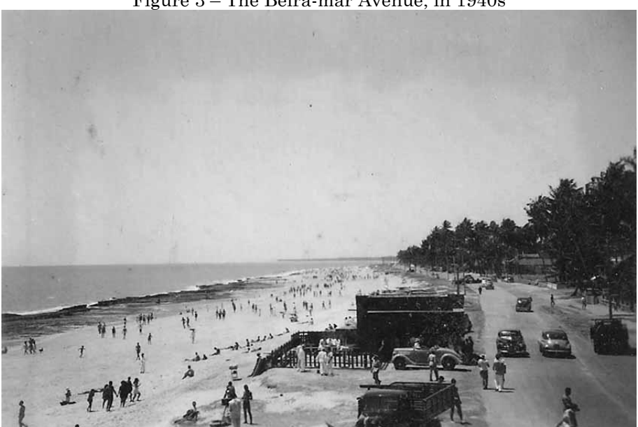
Figure 3 – The Beira-mar Avenue, in 1940s

In the two first decades of the 20th century, several owners and entrepreneurs, many of which owners of lands near these beaches, pressured the government to create access from the city center. Among different proposals, the construction of the Beira-mar Avenue was the one that materialized (Figure 3), which came from the Pina to the Boa Viagem Church.