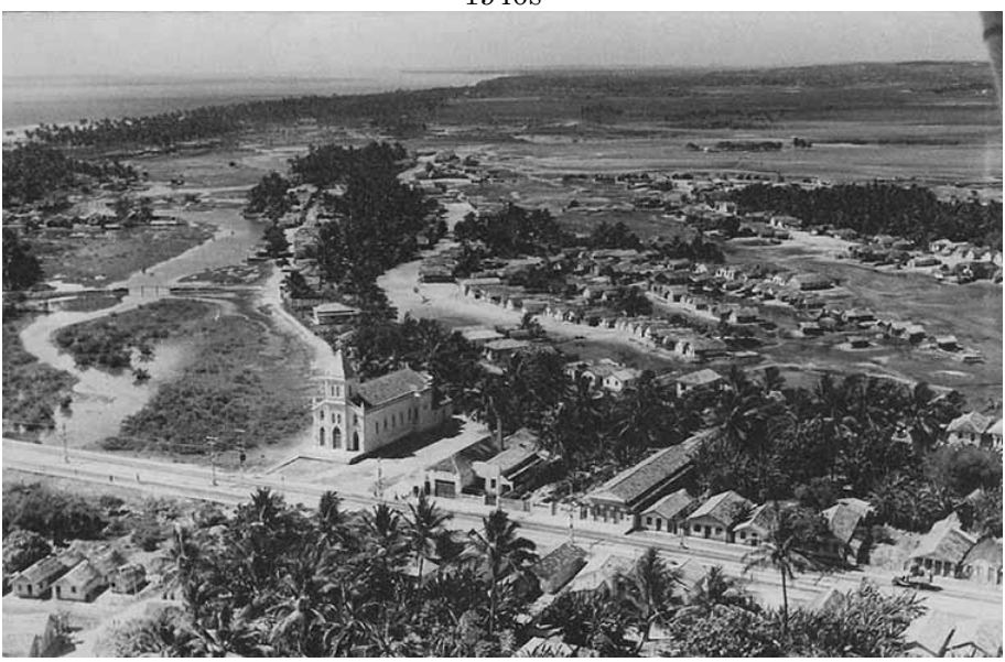
Figure 4 – Aerial view of the neighborhood of Pina with the Ligação Avenue and the Pina Church, 1940s