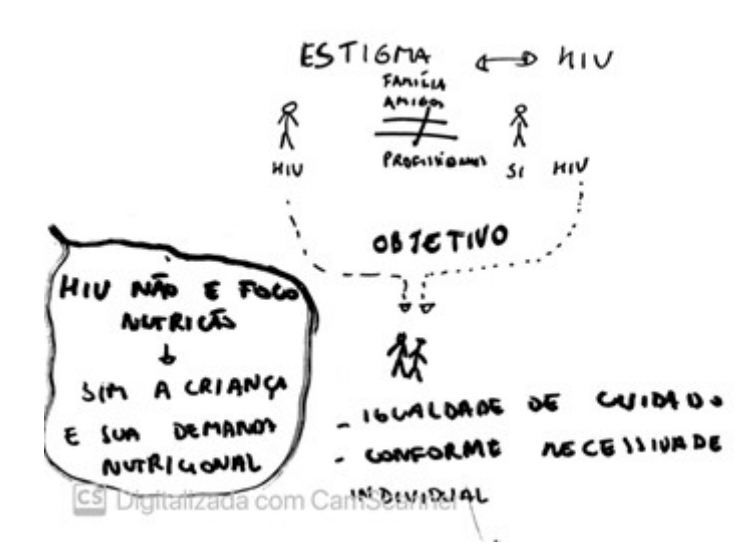
Figure 1 – Artistic production of professional P13. Porto Alegre, Rio Grande do Sul, Brazil, 2022

I found once in the medical record/ that you have to evaluate and look at the whole// which is the housing, what she eats, activities, drugs, sex, all of this is part of the care! (P6).