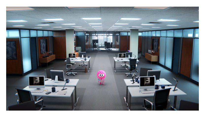
Figure 5. A tiny Purl confronted by the vastness of the empty office illustrates the animation's structural organization.

Figure 6. Then, the boss once again invites everyone to go for a drink. As they are leaving, he is asked if everyone is there, and he says: "Hold up. Not everybody." They walk out surrounding Purl and talking to her, who now feels like one of them, as shown in Figure 7.