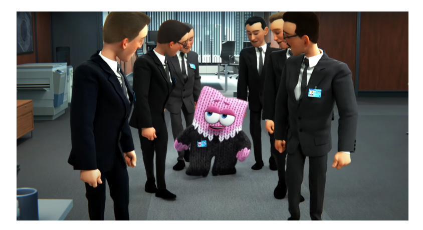
Figure 7. Purl flanked by her colleagues illustrates the animation's structural organization.

that I'm here," to which she responds, "I would say it's unbeweavable." He, however, is welcomed into a new environment (Figure 8), now with men and balls of yarn laughing together at the water fountain and chatting amiably in the conference room.