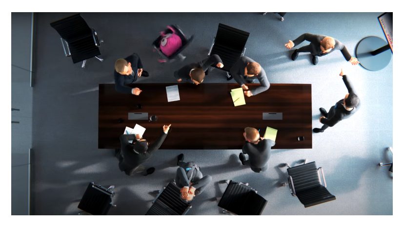
Figure 4. Purl at the margins of the scene illustrates the animation's structural organization.

Two elements of connection between those situations can be found in the lines of the team leader. First, after calling the meeting and presenting the data, he says, "Finance wants answers. Ideas?" When Purl suggests teamwork (and even uses the term "knit," maintaining the relationship with the universe of knitting), she is ignored and pushed into the corner, as in Figure 4. After the meeting, he invites his colleagues to go out for a drink, leaving Purl behind. When asked if everyone is there, he looks at Purl indifferently, saying, "Yeah, that's everybody," and they get on the elevator to leave without her. Purl's sadness at her exclusion is expressed in a scene in which she is depicted as tiny, in a large, empty office (Figure 5).