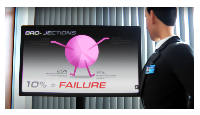
Figure 2. The first presentation of the company's projections contributes to understanding the animation's interactional organization.

This allows us to proceed to the analysis of the animation's interactional organization. To illustrate that use, we have chosen two moments in which the staff meet to talk about the company's performance. The scene opens with the leader of the meeting presenting a pie chart (Figure 2) and saying: "As you can see, we've got a big, fat...," at which point the camera moves away and the word "FAILURE" appears, in red, as the man says: "...failure." The pause after the word "fat" builds up anticipation and takes on an ironic meaning, when it is associated with the title of the presentation. This is an example of the use of modalization in verbal language.