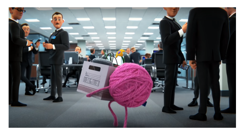
Figure 1. Opening scene shows how images and words contribute to the understanding of the animation's thematic-representational organization.

She seems excited, saying that being there is "Unbelievable," to which the man replies: "Unbeweavable." Here, it is possible to see the use of inference, as the young man makes a pun with the word "weave," as if the scene could not be weaved, i.e., created, could not be real. As Leal (2011, p. 165) reminds us of, "the production of inferences has an essential role in the recognition and construction of meanings, for the reader's knowledge is central to the creation of different understandings for a single text." It is an allusion to Purl being a ball of yarn, which can only be understood if the reader infers the meaning of the scene based on the relationship between word and image. Next, the elevator door opens, and Purl walks into the office and is stared at in surprise by the men, as in Figure 1.