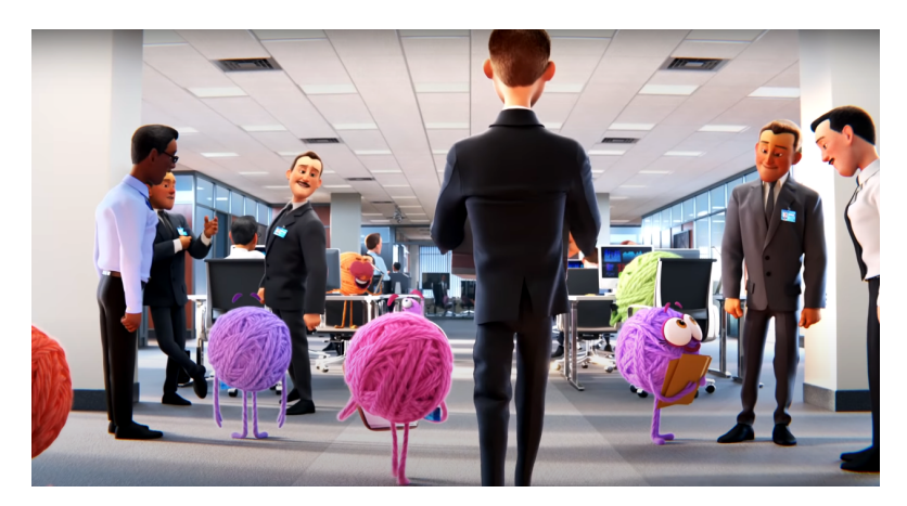
Figure 8. Final scene shows Purl's subversion of order.

that I'm here," to which she responds, "I would say it's unbeweavable." He, however, is welcomed into a new environment (Figure 8), now with men and balls of yarn laughing together at the water fountain and chatting amiably in the conference room.