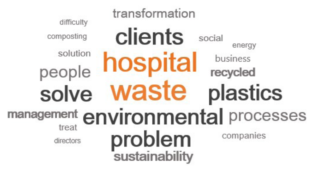
Figure 3 - Interviewee's word cloud.

The results and discussion start with the treatment of the second interview, using the Nvivo12 software. Through this software, the data of the interviewee were analyzed, producing the following word cloud, grouping with stemmed words (Figure 3):