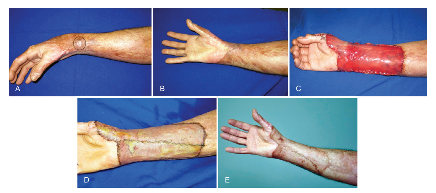
Figure 3 – In A, burn scar contracture in the upper limb. Notice the recurrent ulceration in the delimited area. In B, scar contracture in the upper limb hampering movement of the thumb. In C, defect in the upper limb after contracture resection. Notice the presence of the dermal regeneration matrix. In D, appearance of the grafted area after removal of the negative pressure dressing. In E, 12 months postoperative aspect.

of contractures combines the advantages afforded by the presence of the dermis in the contracture area with the beneficial effect of a thin skin graft when donor areas are scarce. Several studies in the literature have demonstrated that the use of a dermal regeneration matrix improves functional and aesthetic outcomes. In this study, we observed that the quality of the covered area significantly improved without the occurrence of complications in the donor area or the appearance of additional scar contractures.