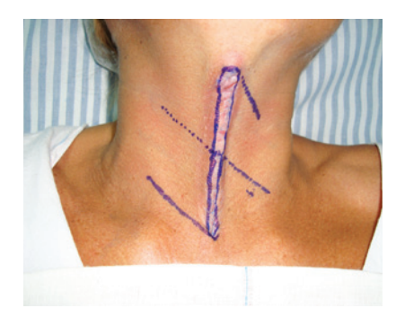
Figure 1 – Preoperative appearance. Marking of the resection line and surgical plane.

cylindrical epithelium without atypia (Figure 6). The dermis contained dense connective tissue, proliferating vessels, and sparse mononuclear inflammatory infiltrate. Skeletal striated muscle tissue and vascularized connective tissue