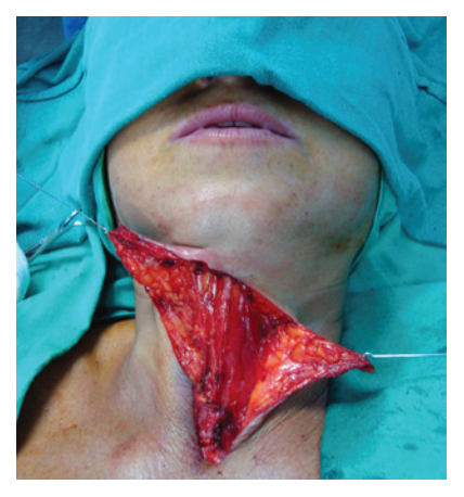
Figure 3 – Intraoperative view. Resected muscular band.

Rev Bras Cir Plást. 2012;27(4):644-7 645