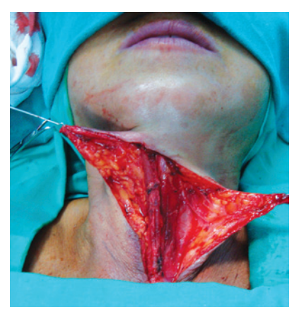
Figure 2 – Intraoperative view. Elevation of the flaps; visible muscular band adjacent to the cleft.