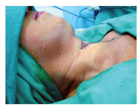
Figure 5 – Immediate postoperative appearance. Side view showing improvement of the contour of the neck.