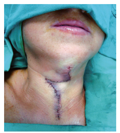
Figure 4 – Immediate postoperative appearance. Final suture of the defect.

The Z-plasty achieved a satisfactory aesthetic and functional result (Figure 8).