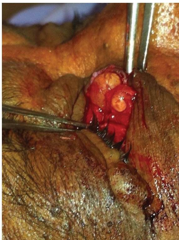
Figure 3. Careful dissection of the lesions - The already exposed, large lesions had an intact capsule.