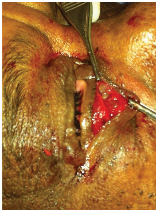
Figure 2. Start of the operation - An infraciliary incision is made under local anesthesia.