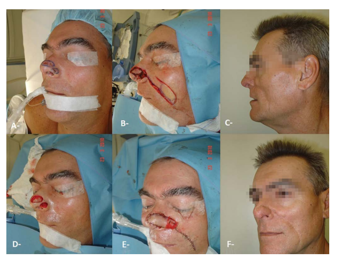
Figure 8. Resection of basal cell carcinoma with reconstruction of nasolabial flap in two different times. A: Preopeative. B,D: Intraoperative. E: Immediate postoperative. C, F: Late postoperative.

Skin cancer types were divided into non-melanoma and melanoma. The most common non-melanoma were basal cell carcinoma that accounted for 70% of diagnoses, followed by squamous cell carcinoma accounting for 25%. The melanoma type had incidence