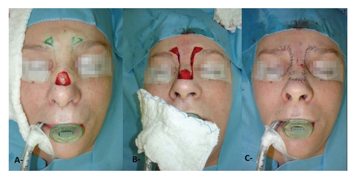
Figure 4. Resection of basal cell carcinoma with reconstruction using advancement flap. A: Defect caused by the tumor. B: intraoperative. C: Immediate postoperative.

followed by 18% operated on for melanomas in situ, 5% and 2% for nodular type sacral, lentigo 2% and 1% desmoplastic melanoma, 1% had spitzoid melanoma. Most cases had thin melanoma and median was 0.92. Of these, 8.74% were ulcerated and 8.74% had regression, there were no cases reported related with melanoma in situ cases which did not present specification as ulceration and regression. The mitotic index showed an average of 1.86 and median of 1 (Table 6).