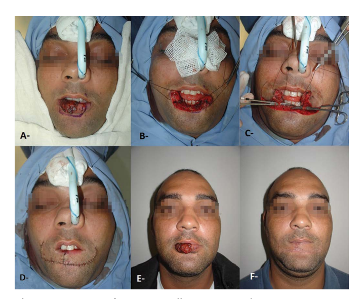
Figure 9. Resection of squamous cell carcinoma and reconstruction using Karapandzic flap. A, E: Preoperative. B: After tumor resection. C: Preservation of vessels and nerves. D: Immediate postoperative. F: Late postoperative.

Prognostic factors for melanoma include multivariate analysis of primary melanoma such as patient's age, sex, site of primary tumor thickness, ulceration and index mitotic<sup>4</sup>. In melanoma type, we analyzed patient's age, sex, site of the tumor, thickness, ulceration, regression, however, there was no enough follow-up data to indicate the prognosis.