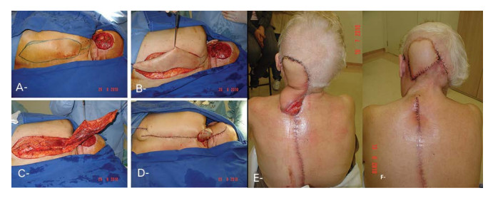
Figure 3. Use of patent blue and technetium for surgery of sentinel lymph node research. A: Congenital melanocytic nevus. B, F: Acral Lentiginous Melanoma. C: Merkel cell carcinoma. D: Sentinel lymph node. E: Forearm melanoma. G: Chest melanoma with axillary sentinela. H: Probe.

The histopathological evaluation of tumors based on classical criteria of cytologic atypia and architectural showed that 385~(95.29%) were malignant and 19~(4.7%) were benign.