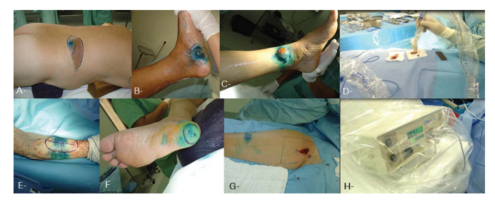
Figure 2. Resection of melanoma with craniectomy and reconstruction using trapezius muscle flap. A: After tumor resection plus cranioectomy because of bone invasion. B, C: Lifting of flap. D: Immediate postoperative period. E: 2nd waiting time. F: Postoperative.

Mitotic index greater than or equal to 1 mm<sup>2</sup>; Clark IV and V.