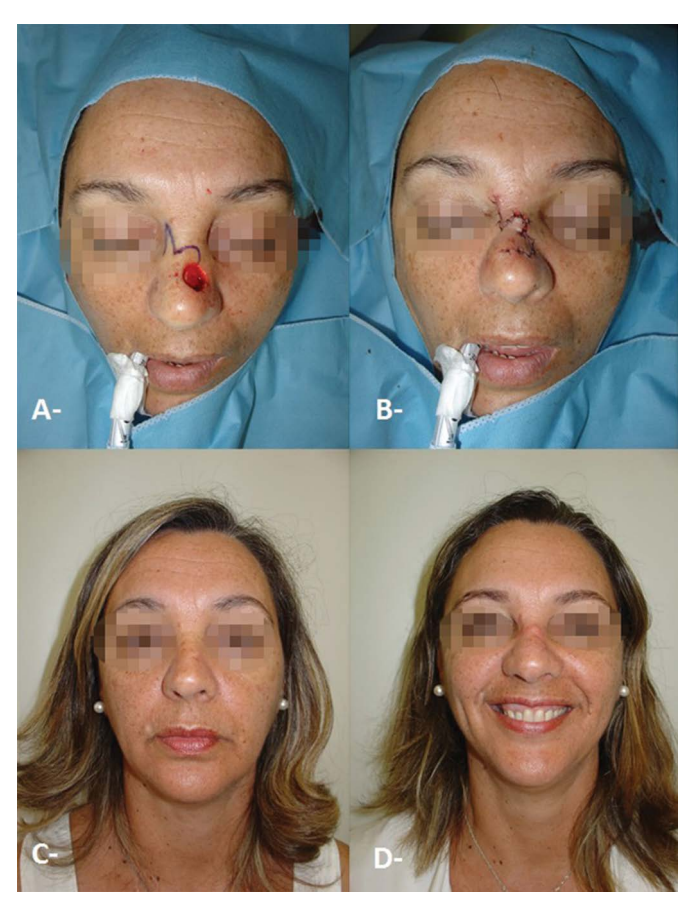
Figure 7. Resection of basal cell carcinoma with reconstruction using bilobed flap. A: Defect after tumor resection. B: Immediate postoperative. C: Preoperative. D: Late postoperative.

This study analyzed the effectiveness of surgical procedures performed by plastic surgeon along with a multidisciplinary team to treat skin cancer.