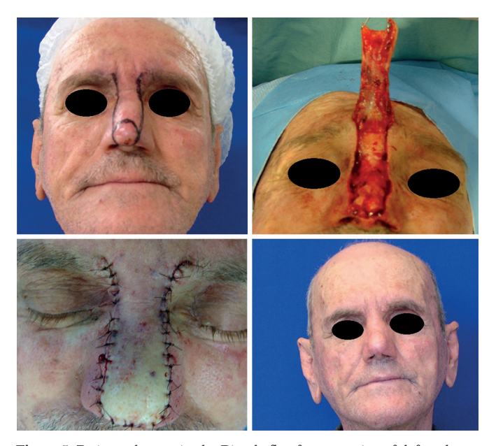
Figure 5. Patient who received a Rintala flap for correction of defect due to squamous cell carcinoma in the nasal tip.

In the nasal tip, primary closure was performed in 16 (62%) cases, Rintala flap in 5 (19%), bilobed nasal flaps in 3 (12%), and tertiary closure and graft in 1 case each (4%) (Figure 5).