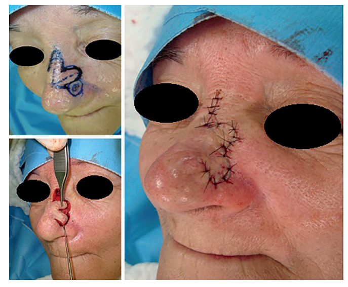
Figure 3. Patient who received a bilobed flap for correction of defect due to squamous cell carcinoma in the nasal wing.

In the nasal dorsum, there were 17\,(47\%) primary closures, 6\,(17\%) bilobed flaps, 5\,(14\%) Rintala flaps, 2\,(6\%) each of glabellar, grafts, and closure by the third