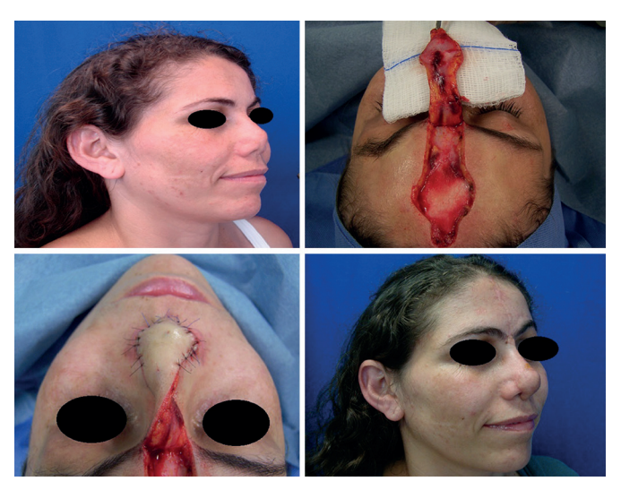
Figure 4. Patient who underwent reconstruction of nasal deformity with frontal flap.

intention, and 1 (3%) frontal and nasolabial flap, each (Figure 4).