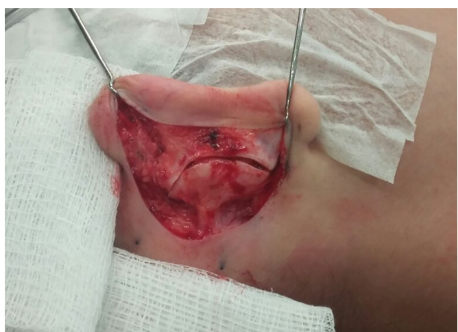
Figure 1. Exposure of the conchal cartilage while keeping the posterior perichondrium intact.

The detached area should be appropriate to the volume and shape of the graft, and does not require its fixation. However, in cases where the dorsum is larger than the graft, the latter should be fixed to the dorsum or sutured. The plaster or moldable bandages were left for 2 weeks.