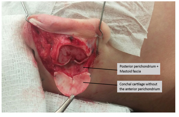
Figure 3. Dissection of the posterior perichondrium along with the mastoid fascia.