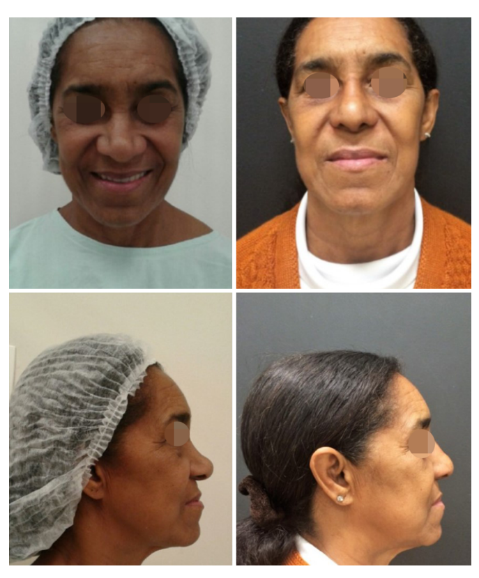
Figure 7. Ethnic characteristics before and after operation.