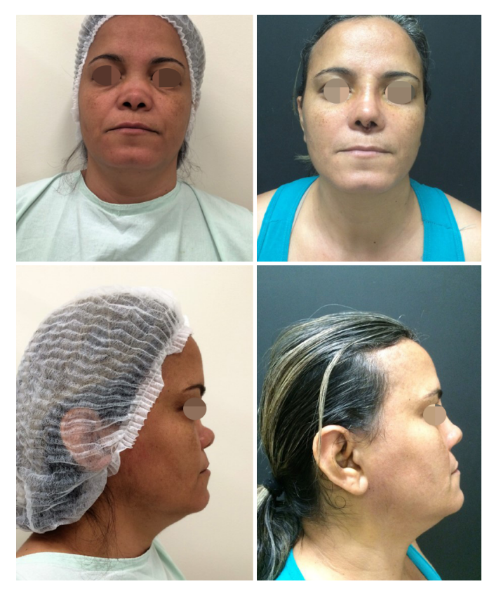
Figure 9. Traumatic sequelae before and after operation.