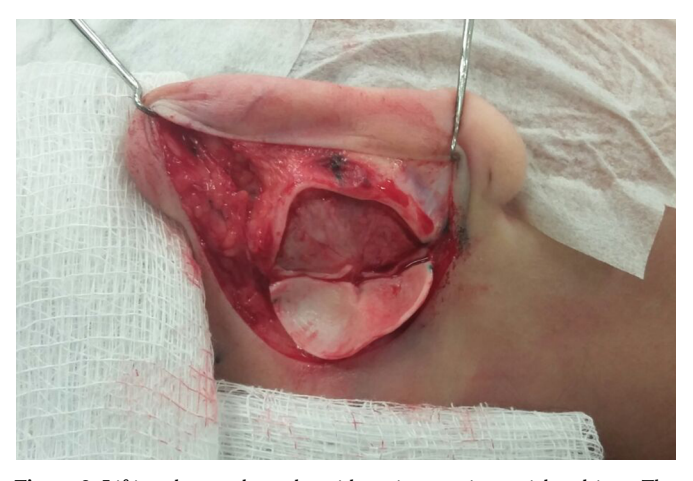
Figure 2. Lifting the nasal concha without its anterior perichondrium. The posterior-most incision of the nasal concha is made without damaging the posterior perichondrium.

After the end of this rhinoplasty phase and preparation of the space to augment the dorsum, the auricular conchal cartilage was captured along with its perichondrium and mastoid fascia. A spindle of retroauricular skin was removed without removing the perichondrium. The upper portion of the graft to be obtained (lateral side of the nasal concha; Figure 1) was cut. This was then removed from the skin of the anterior portion of the concha until the desired width and length of the graft was attained, and the lower part of the graft was entirely incised, anteroposteriorly, by preserving the perichondrium (Figure 2).