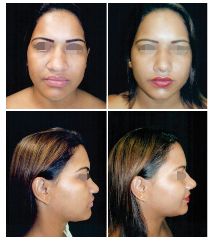
Figure 6. Ethnic characteristics before and after operation.

The nine patients were satisfied (3) or happy (6) with the nasal procedure. The patients had no aesthetic complaints regarding the donor area of the graft, and 3 patients reported paresthesia in the posterior region of the ear in the first few postoperative months. Those with greater evolution who were monitored for a longer period did not report paresthesia eventually (Figures 6-9).