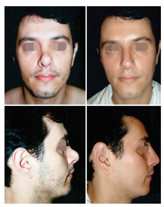
Figure 8. Surgical sequelae before and after operation.