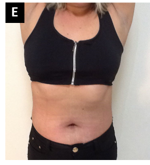
Figure 3. A: Initial surgical incision. Initial surgical incision in the umbilical region; B : Excision of lesions with free surgical margins. Excision of the lesions; C : Umbilical tissue was excised and compared with the size of the scalpel. Umbilical tissue was excised; D : Immediate postoperative result of partial reconstruction of the umbilicus; E : Late postoperative result of partial reconstruction of the umbilicus.

nodule associated with pain and bleeding during the menstrual period.