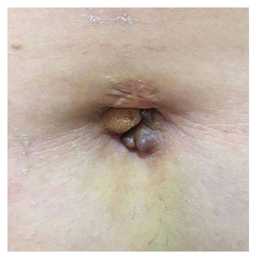
Figure 1. Patient with vegetative umbilical lesions. Surgical scar due to previous piercing. Vegetative umbilical lesions.

Several hypotheses have been proposed to explain the pathophysiology of primary umbilical endometriosis. The most accepted hypothesis in women with concomitant pelvic endometriosis is embolization of endometrial tissue via hematogenous or lymphatic routes. However, metaplasia of Müllerian duct remnants is more likely in patients with cutaneous endometriosis