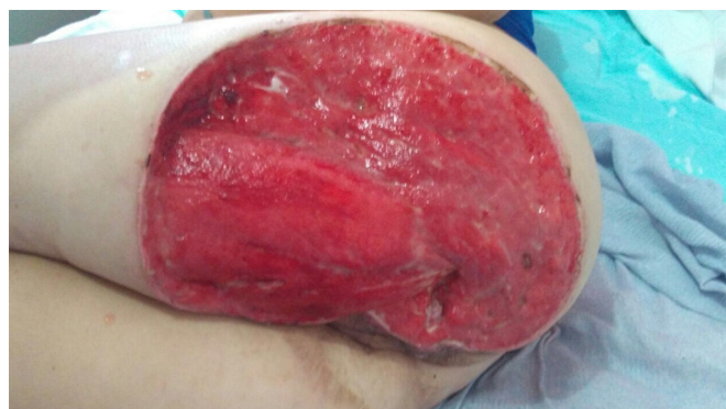
Figure 4. Result with granulation tissue ready for skin grafting.