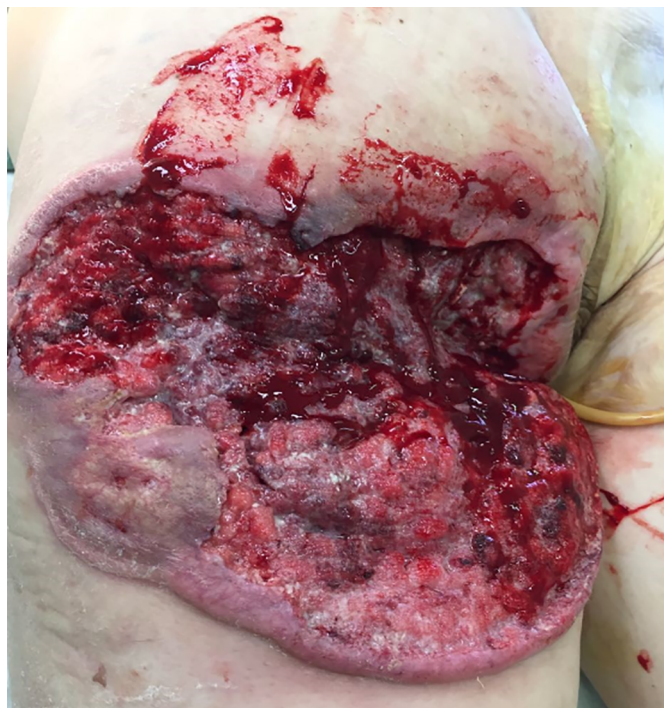
Figure 1. Epidermoid carcinoma in the right gluteal region and part of posterior region of the leg. Eleven years after surgical correction of pressure ulcer.

evidence of recurrent carcinoma (Figures 1, 2, 3, 4 and 5). The patient signed an informed consent form for the publication of the current report. The ethics committee approved the case with number 2,402,686.