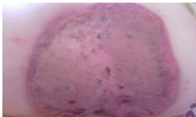
Figure 5. Result after graft.