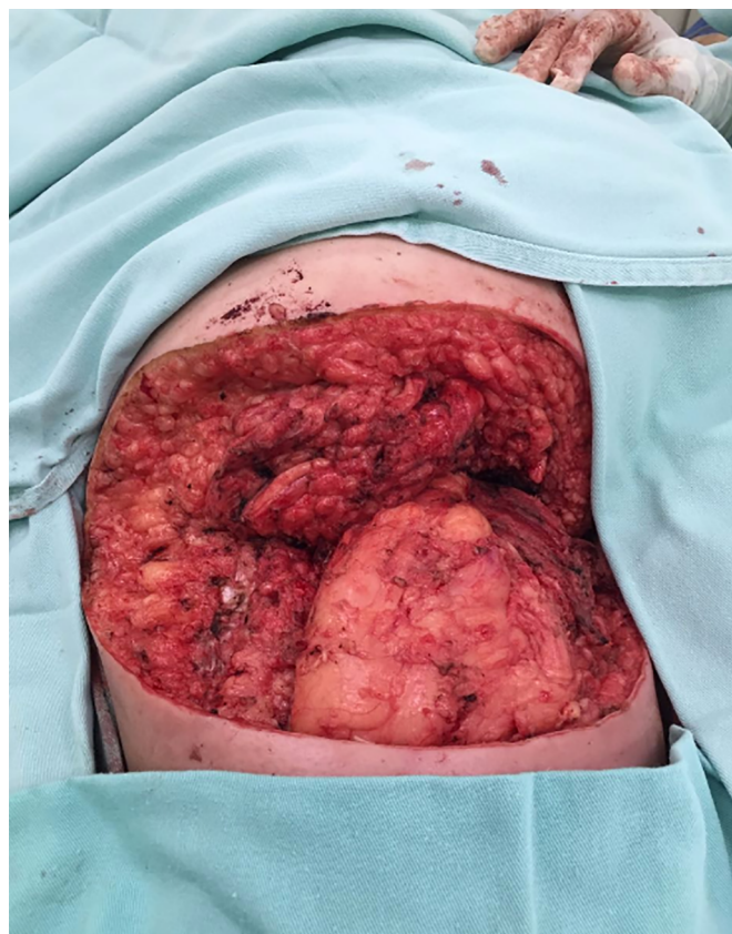
Figure 3. Postoperative result after radical surgical excision.