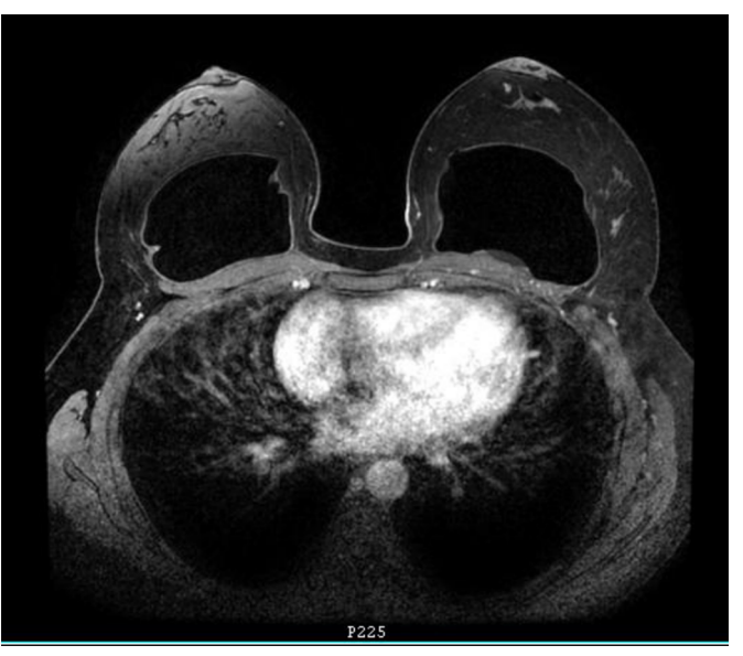
Figure 2. MRI 2019 with small septation in the posterior region of the left

After the prosthesis placement in this patient in 2015, there was dehiscence in the left breast surgical wound that may have favored the formation of a biofilm around the left implant <sup>2,6</sup>, which could explain