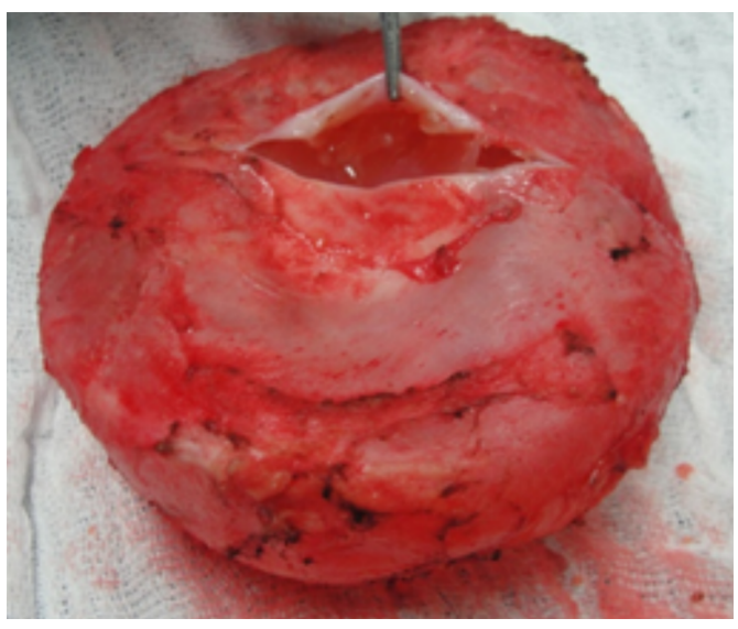
Figure 3. Septation in the posterior region of the left breast capsule after total block capsulectomy.