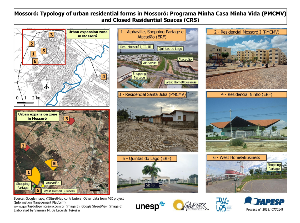
Figure 2- Mossoró: commercial spaces, services, and housing typologies.

The Partage shopping mall is located in the Nova Betânia neighborhood, considered a zone of expansion in the city. It has fostered a new form of consumption beyond the central area in an ongoing process of multiplication of central areas or multicentrality, thus, structuring a characteristic element of socio-spatial fragmentation and changing the former monocentric pattern (SPOSITO, 2007; WHITAKER, 2017) or even traditional centralities (SPOSITO; GÓES, 2013).