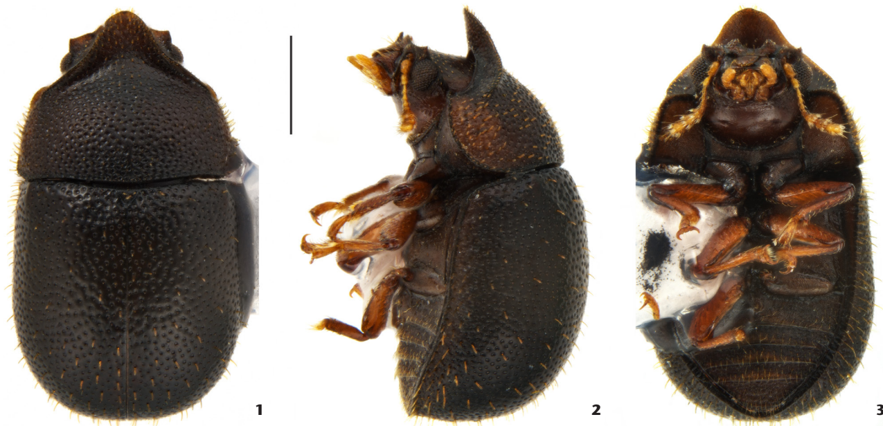
Figures 1-3. Adult male holotype of Falsocis sooretama sp. nov.: (1) dorsal view; (2) lateral view; (3) ventral view. Scale bar: 0.5 mm.

(Fig. 7) about four times as long as broad, subcylindrical, lateral margins parallel in the anterior two-thirds of their lengths, and apex subtriangular and membranous.