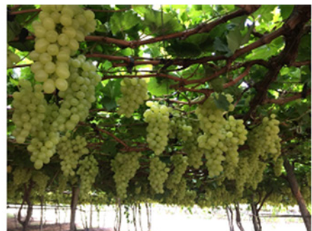
Figure 4. Grape bunches of the cultivar BRS Tainá, Petrolina, PE, Brazil, 2019.