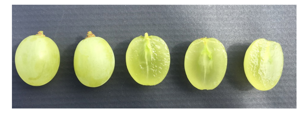
Figure 3. Berries cut lengthwise showing imperceptible traces of seeds.

combining gibberellins and cytokinins should be performed to promote berry growth and bunch development with standards acceptable for commercialization.