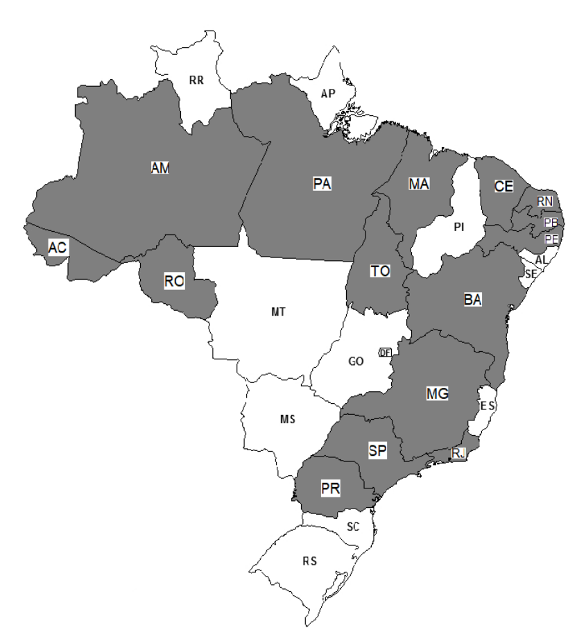
FIGURE 2 - States with knowledge of Notivisa greater than national percentage.

BSc: Bachelor; MSc: Master; PhD: Doctoral; Postdoc: Postdoctoral fellowship.