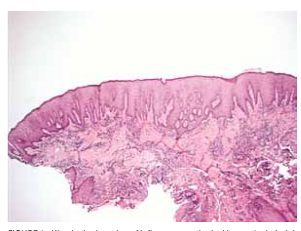
FIGURE 4 - Histological section of inflammatory gingival hyperplasia (original color: HE; smaller magnification).