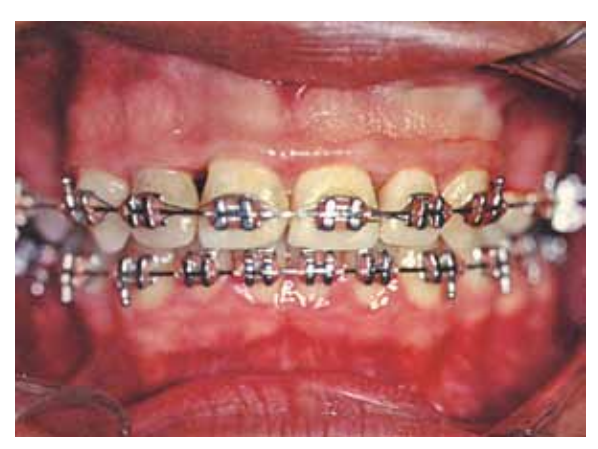
FIGURE 5 - Postsurgical view after 20 days showing satisfactory repair in the region between 41 and 42 teeth.