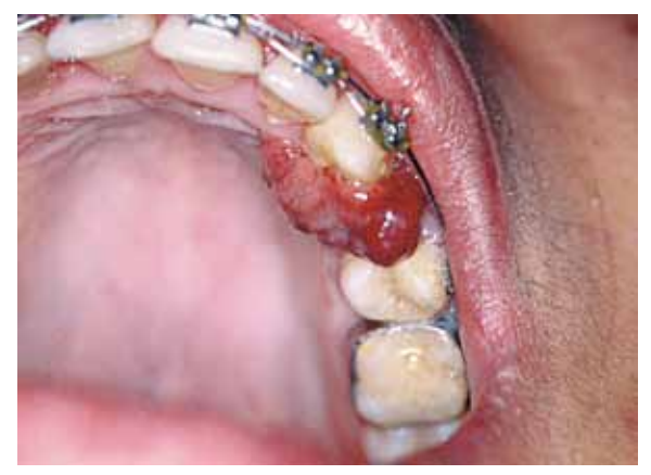
FIGURE 1 - Erythematous tumor mass with heavy bleeding to the touch, resembling pyogenic granuloma.

On examination, a tumor-like lesion was observed, of erythematous color, irregularly shaped, with a smooth surface and pedunculated base, located in an edentulous region between teeth 23 and 25, under occlusion trauma. The condition had been developing for a week, starting with a node in the aforesaid region. The diagnostic hypotheses were pyogenic granuloma, gingival hyperplasia and peripheral giant cell lesion (Fig 1). Tooth 24 had been extracted 4 months earlier with no history of postoperative complication. The other lesion was observed between teeth 41 and 42. It was characterized by moderate gingival enlargement, pale pink in color, sessile base, smooth surface extending from the papilla to the brackets. The hypothetical diagnosis was inflammatory gingival hyperplasia (Fig 2). Radiographs of the lesions yielded no significant findings.