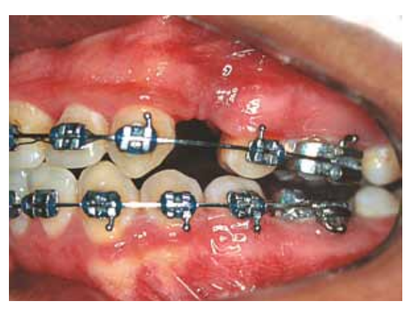
FIGURE 6 - Satisfactory repair with no signs of recurrence after periodontal treatment and second surgical procedure.