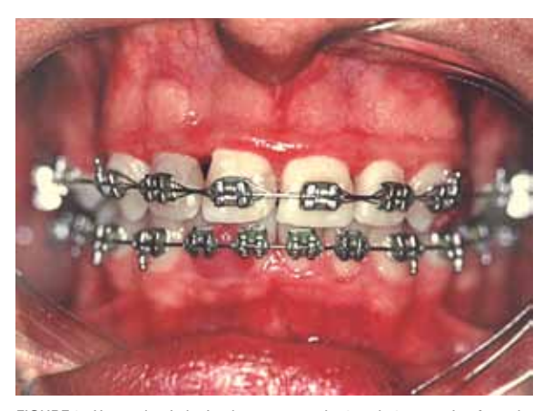
FIGURE 2 - Hyperplastic lesion between teeth 42 and 43 stemming from the keratinized gingiva and indicative of inflammatory gingival hyperplasia.