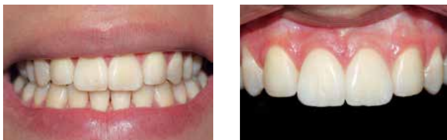
Figure 6 - Observe the canines esthetics.

upper and lower teeth, cemented rings on first molars of both arches and second lower molars.