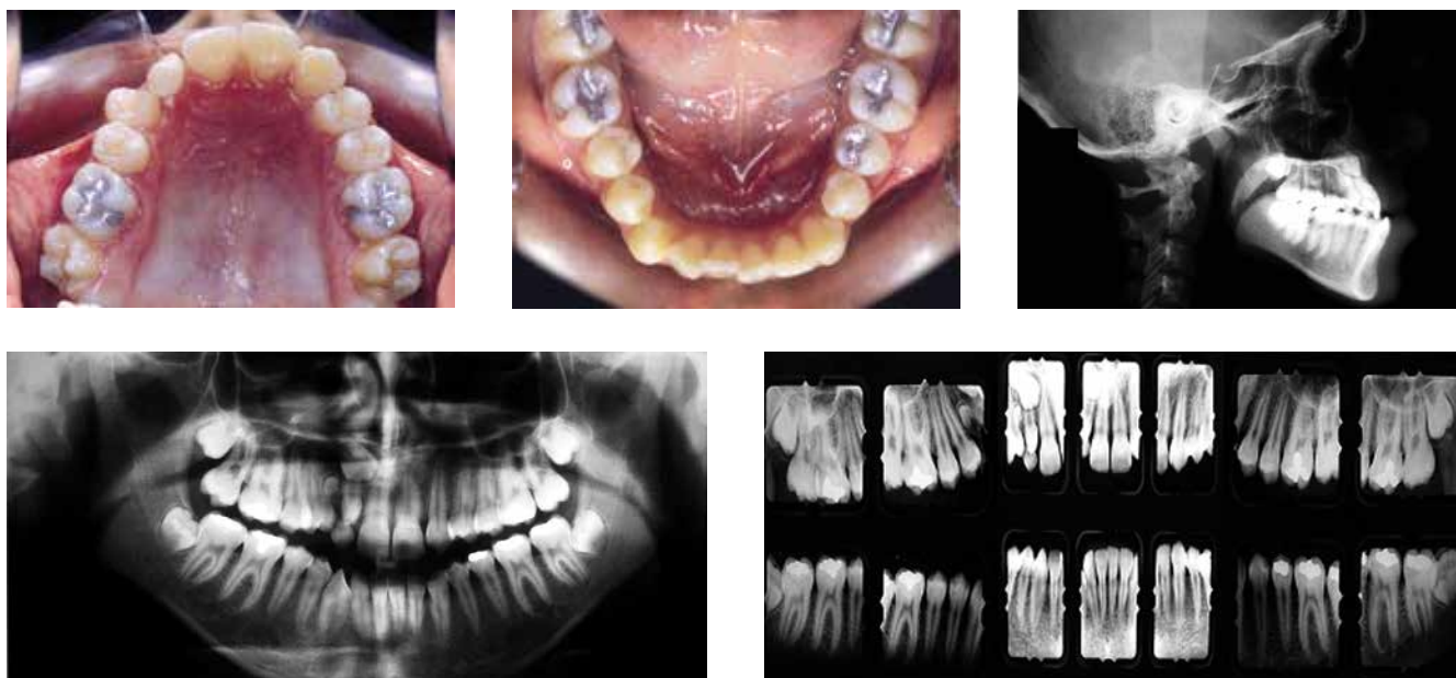
Figure 2 - Occlusal photographs and initial radiographs.