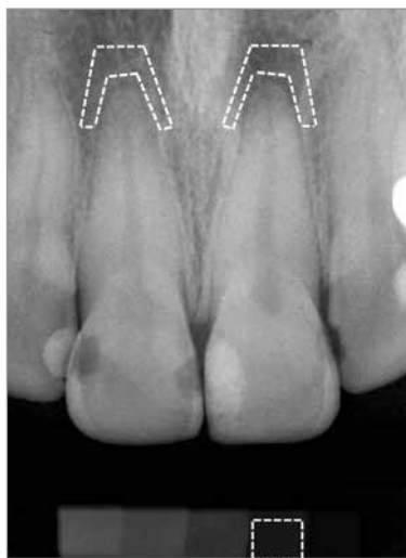
Figure 2 - Scanned periapical radiograph; region of interest selected in apical region of upper central incisors and on second step of aluminum step-edge (assessed using Adobe Photoshop CS2 software histogram tool).

Periapical radiographs of the upper incisors were taken using X-ray equipment (RX Timex 70 C, Gnatus, Ribeirão Preto, SP, Brazil) operating with 70 kVp, 7 mA and a 0.25-second exposure time. A five-step 2 x 20 x 3.5 mm aluminum wedge (Al step-edge) was attached to the apical region perpendicular to the film (Agfa Dentus M2 "Comfort"). Kodak developing and fixing solutions (Kodak Brazil, Commerce and Industry Ltda, São