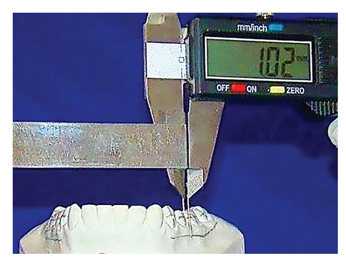
Figure 1 - Measurements performed on casts showing the parallel position of the modified digital caliper to the occlusal plane. Pencil lines were drawn on the WALA ridge in the region of the four mandibular posterior teeth.