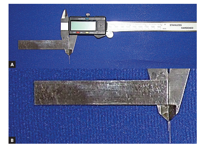
Figure 2 - A) Modified digital caliper. B) Closer view of the main part of the modified caliper.

Reliability was considered adequate. High concordance with values greater than 0.806 was found for inter and intra-evaluator evaluation (Table 1).