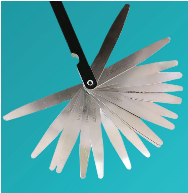
Figure 7 - Feeler gauge to measure the amount of separation at teeth contact point.