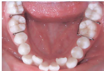
Figure 5 - Intraoral photograph of the patient using Kesling separator on one side and Kansal separator on the other (Group 2).