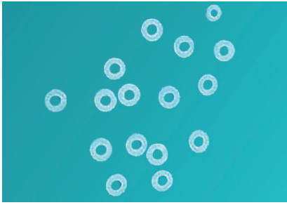
Figure 1 - Elastomeric separator (Ortho Organizers).