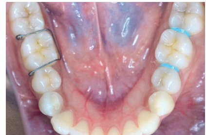
Figure 6 - Intraoral photograph of the patient using Elastomeric separator on one side and Kansal separator on the other (Group 3).