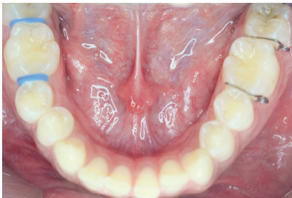
Figure 4 - Intraoral photograph of the patient using Elastomeric separator on one side and Kesling separator on the other (Group 1).