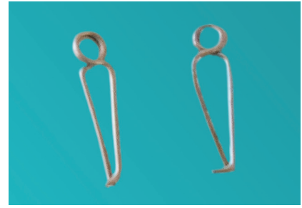
Figure 3 - Kesling separator.