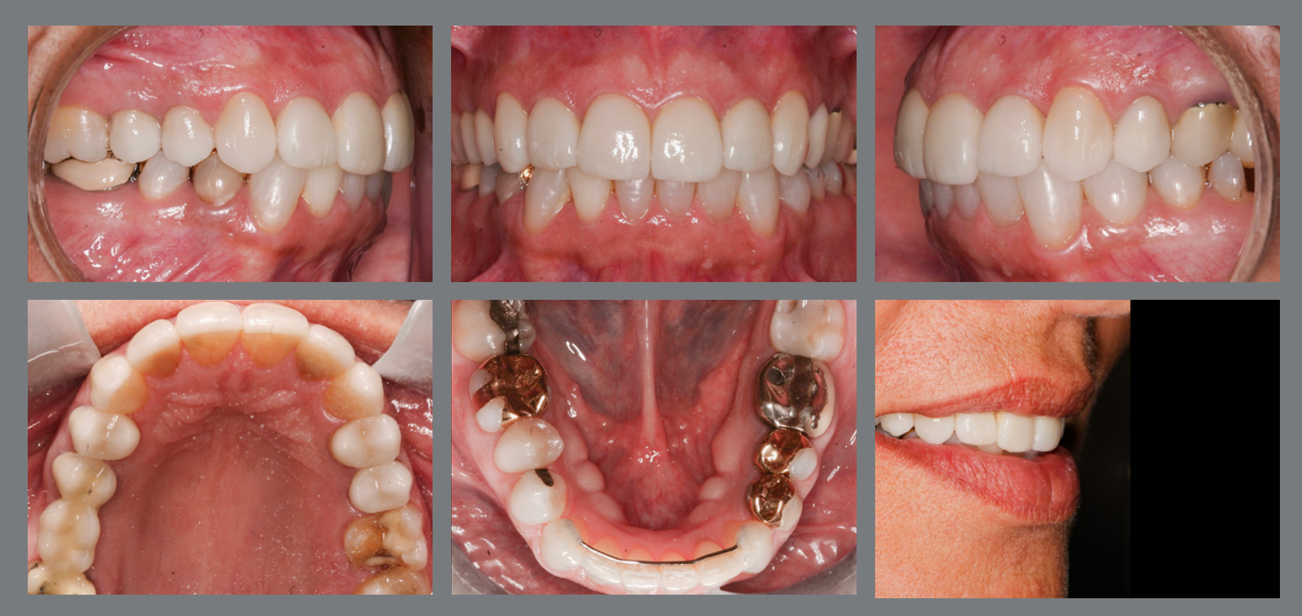
Figure 4: Incisor projection (associated with interproximal stripping of mandibular anterior teeth) to dissolve the mandibular crowding, and subsequent reshaping of maxillary incisors with ceramic veneers, and lip volume harmonization.