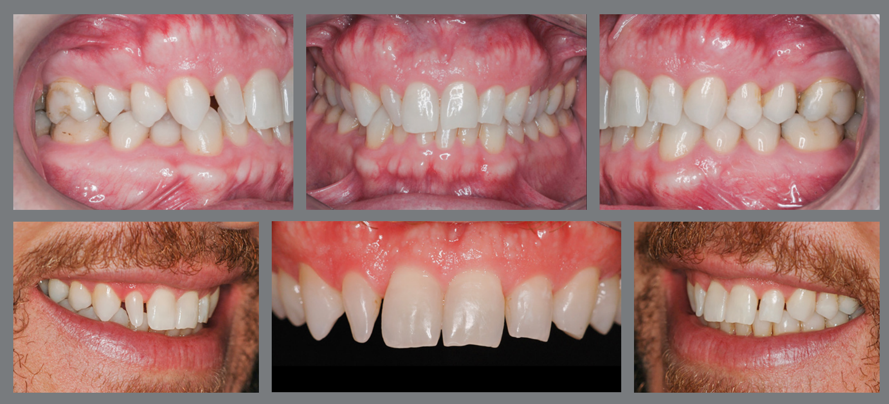
Figure 1: Orthodontic preparation, with space opening for reshaping of lateral incisors with abnormal shape and size.