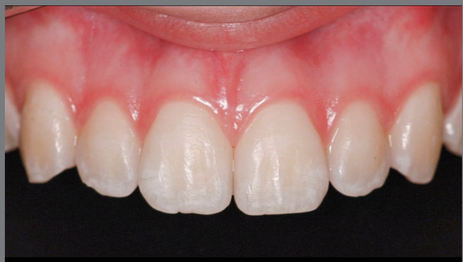
Figure 6: Detail of the shape of proximal surfaces of anterior teeth: straight mesial surfaces of central incisors, and convex distal surfaces of lateral incisors and mesial surfaces of canines.