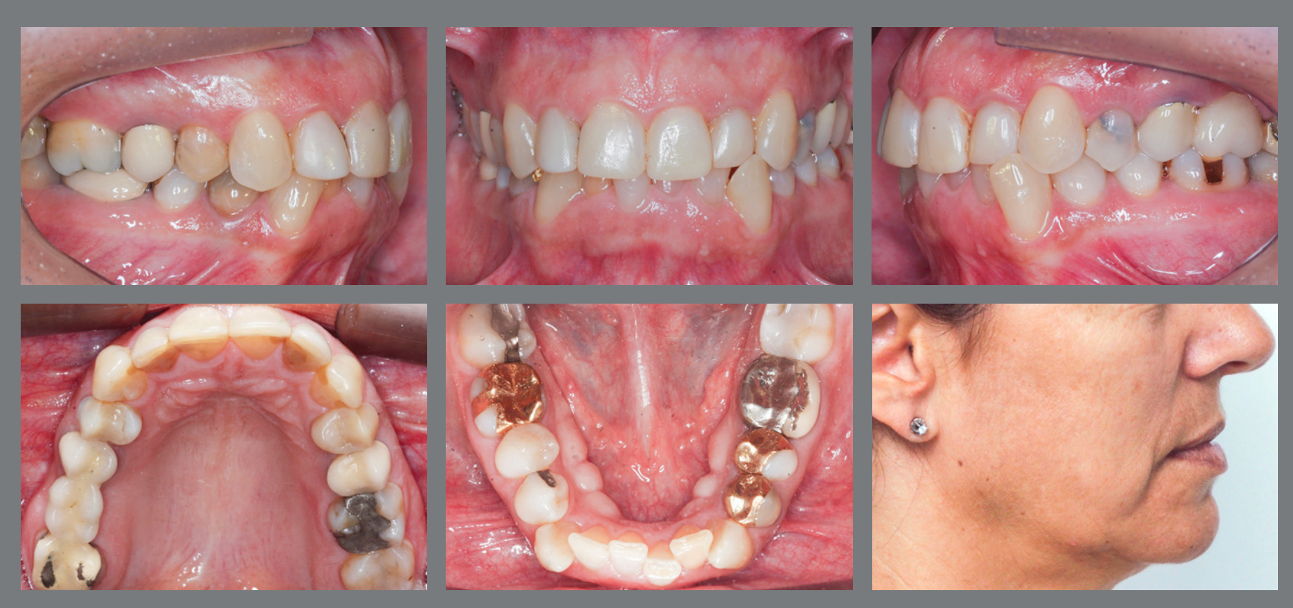
Figure 3: Bolton discrepancy, with excess lower tooth volume and retracted upper lip. Indication of protrusion and addition of restorative material in the maxillary incisors, to harmonize the proportion between maxillary and mandibular incisors and increase the upper lip volume.