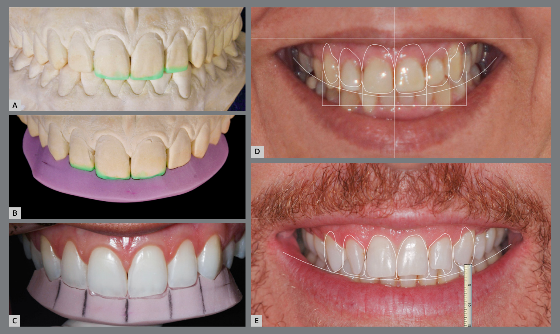
Figure 9: Waxing (A, B, C) and digital smile planning (D, E) before incisor reshaping.

performed at various times during treatment, yet it should be done during initial planning and at the time between orthodontic finalization and accomplishment of restorative procedures. For this, there are two options: diagnostic wax-up and digital smile planning (Fig 9).