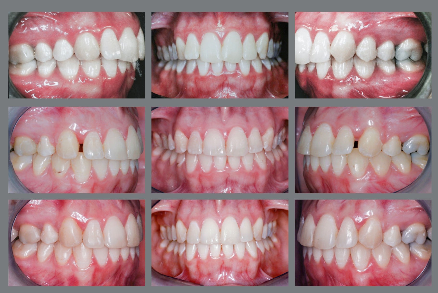
Figure 2: Case of Bolton discrepancy (with excess lower tooth volume) treated by interproximal stripping of mandibular incisors and canines, and addition of resin in the maxillary incisors and canines. Even though the maxillary teeth had adequate shape and dimension, it was necessary to reshape them to avoid excessive stripping on the mandibular teeth to compensate for the tooth size discrepancy between maxillary and mandibular teeth.

adequate overjet and remaining spaces between the maxillary anterior teeth (Fig 2). Thus, if the spaces are closed by retraction of incisors, an anterior crossbite will be created, while if they are closed by mesialization of posterior teeth, the canines will change from key occlusion to a Class II relationship. Neither of the two options should be considered.