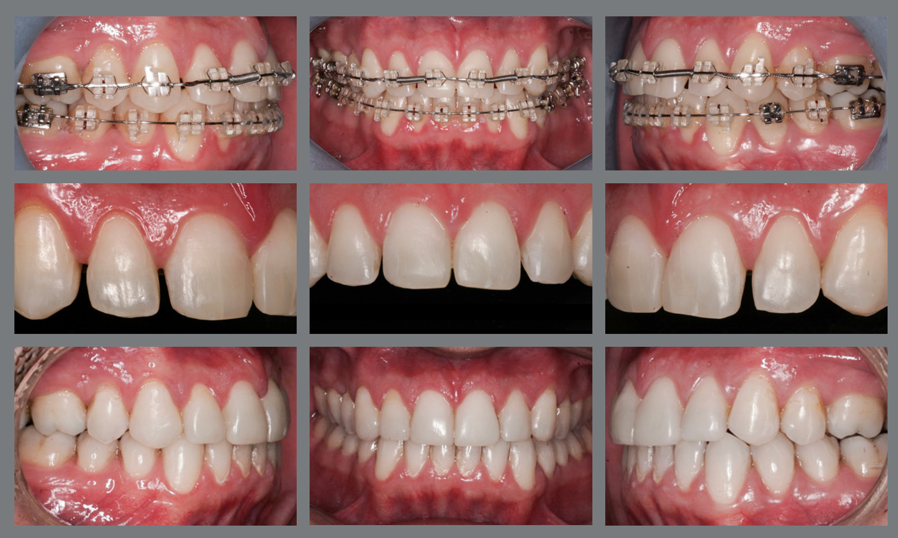
Figure 10: Confirmation of the final position of teeth, with the appliance still in place, to allow for any adjustments still necessary at that moment.