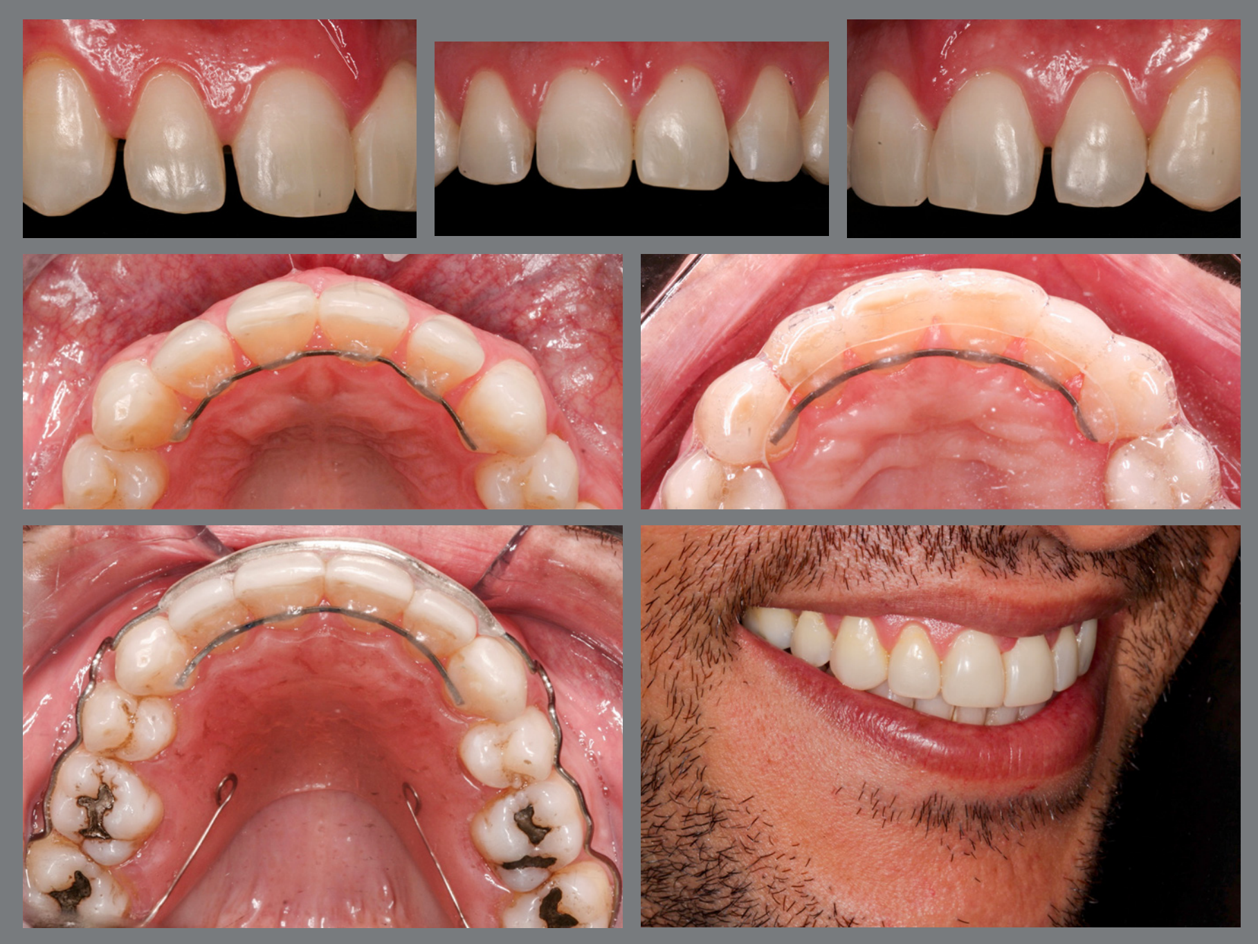
Figure 12: Fixed lingual retainer associated with removable appliance, for maintenance of incisor position during the period between removal of orthodontic appliance and accomplishment of restorations.