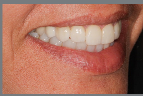
Figure 5: Ceramic veneer, compensating the excessive buccal tipping resulting from the projection of maxillary incisors.