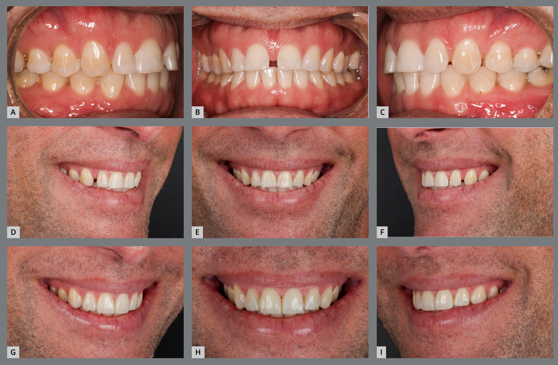
Figure 8: Closure of midline diastema ( A-C ) by means of an interdisciplinary approach. The maxillary incisors were mesialized, to orthodontically close the diastema, displacing the spaces to the posterior region ( D-F ), avoiding the need to insert restorative material in the mesial surfaces of these teeth. To coincide the upper dental midline with the facial midline, teeth #11 and #12 were moved more than teeth #21 and #22. Then, the spaces were closed by adding composite resin on the distal surfaces of lateral incisors and mesial surfaces of canines ( G-I ). The central incisors were increased vertically to provide a better height/width ratio, a more harmonious smile arc and adequate overbite.