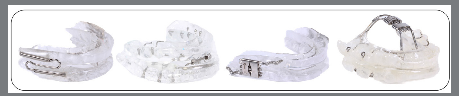
Figure 3: Different mandibular advancement devices (individualized bi-blocks made of rigid acrylic plates that allow titration).

In a longitudinal review published in 2020, Venema et al.<sup>44</sup> reported that both MAD and CPAP therapy resulted in positive outcomes after 10 years of follow-up. Therefore, dental professionals should know how to manage the possible long-term side effects of MAD therapy. Expected long-term side effects include the projection of the lower incisors and retroclination of upper incisors, with consequent reduction of overjet and overbite.<sup>45-47</sup> The intensity of these side effects varies between patients. Low-intensity vertical skeletal effects (clockwise mandibular rotation) may also occur in the long term.<sup>46,47</sup> A recent systematic review with meta-analysis<sup>47</sup> on the long-term effects of MADs revealed an increase of 1.54±0.16° in lower incisor proclination, reduction of 0.89±0.04 mm in overjet and 0.68±0.04 mm in overbite, downward and forward mandibular rotation and reduction in SNA angle of 0.06±0.03°.