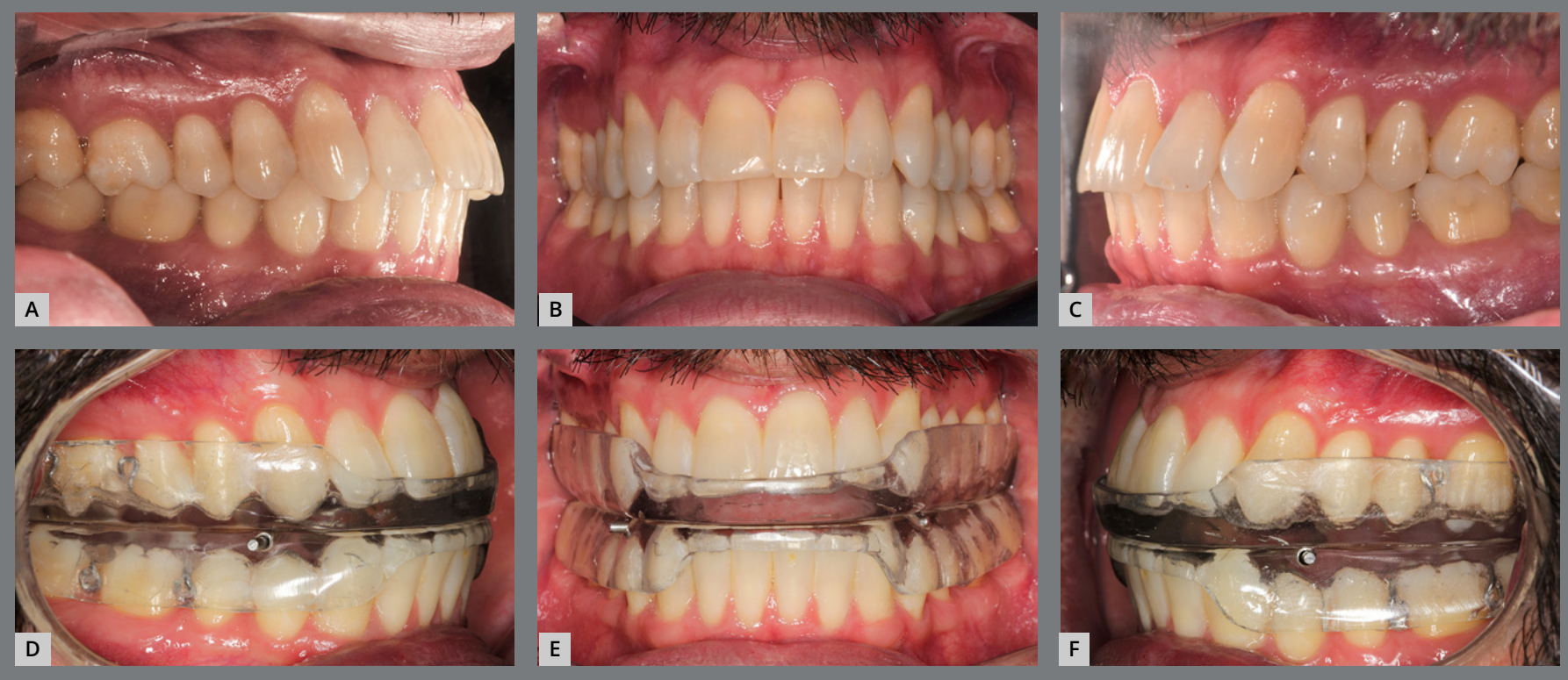
Figure 2: A, B, C) Intraoral view of a patient in maximum intercuspation. D , E , F ) The same patient using a mandibular advancement device.

MADs are indicated for the treatment of primary snoring and mild to moderate OSA. Patients demonstrate a high tolerance to the use of MADs and therefore these devices are also indicated in the treatment of severe OSA in patients who cannot stand the use of CPAP.<sup>24,37,38</sup> In patients with mild or moderate OSA, MAD reduces the severity of OSA, and excessive daytime sleepiness, and improves the quality of life,<sup>39</sup> besides reducing the amount and intensity of snoring events.