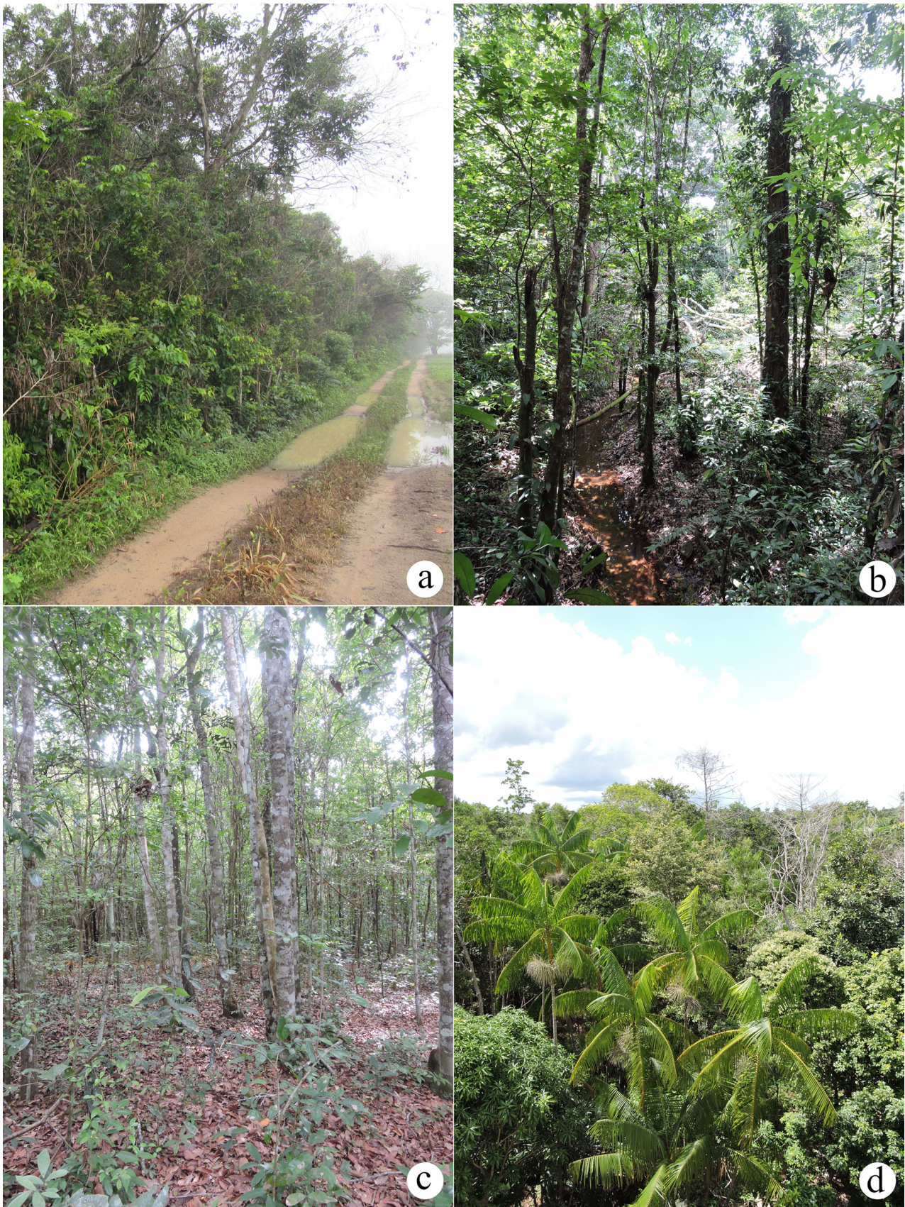
Figure 2. Landscapes of Reserva São Geraldo Majela in the State of Pará, Brazil. a. Edge area. b-c. Interior areas. d. Aerial view of part of the Reserve.