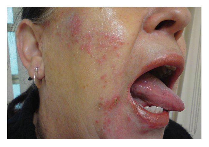
Fig. 3 - Facial cutaneous reaction an IFX-treated patient.