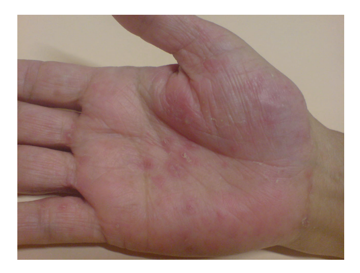
Fig. 4 - Hand cutaneous reaction during IFX treatment.