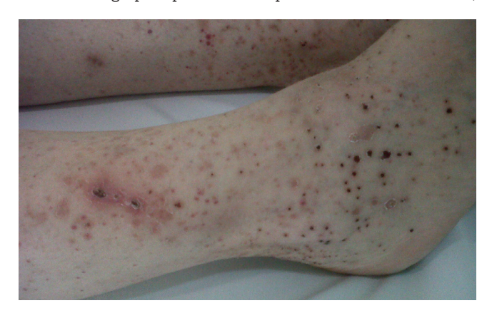
Fig. 1 – Leukocytoclastic vasculitis after 3 years of ADA treatment.

The two groups of patients included in this study were considered to be homogeneous. The median age of patients receiving IFX was 41.3 years, this being similar to that found in the literature in two studies with large patient samples, in which the median ages were 35 and 37 years.<sup>8,13</sup> With regard to the demographic profile of the patients treated with ADA,