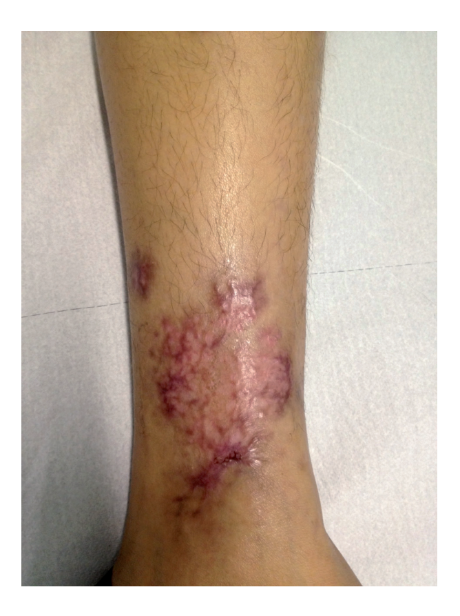
Fig. 2 - After the third infusion of IFX. Ulcer is at the end of granulation phase, still reddish in appearance, showing almost complete epithelialization.

Even after completed treatment for PG, the patient continued using IFX regularly, which also resulted in a great impact on intestinal symptoms. Currently, she reports 1-2 daily episodes of bowel movement without mucus, pus or blood.