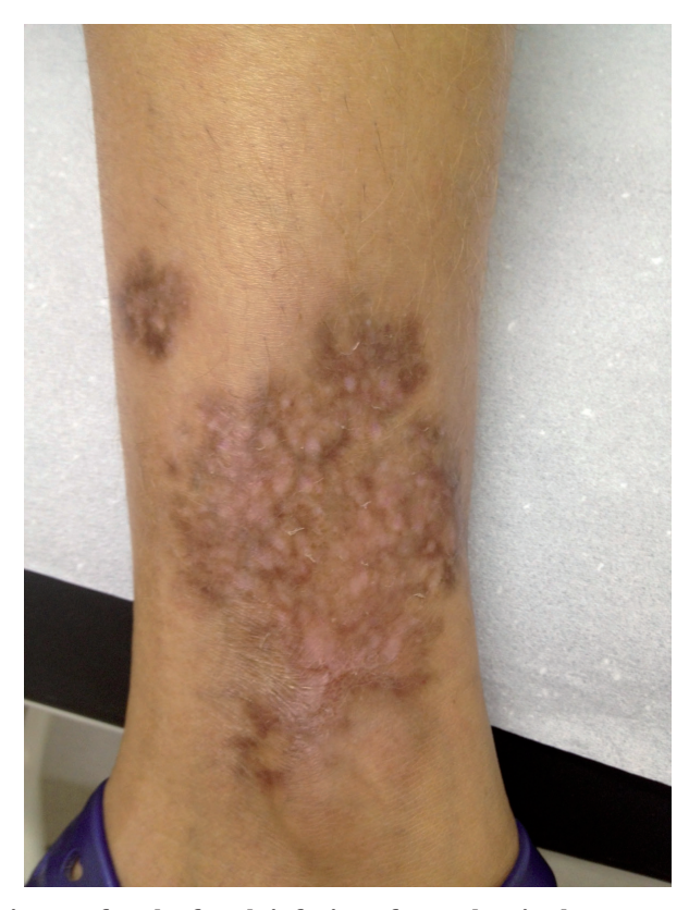
Fig. 3 - After the fourth infusion of IFX. Ulcer is shown at an advanced healing stage, with similar color to the surrounding skin, showing contraction of edges.