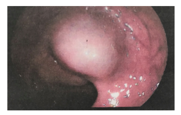
Fig. 1 – Perianastomotic lesion discovered in a follow-up colonoscopy.

In March 2018, she reported, after 2 years of follow-up, diarrhea twice a month, more than five liquid bowel movements / day, with mucus, without blood. She denied associated systemic symptoms, with normal bowel habits in the intervals. Normal proctological examination. The rectosigmoidoscopy showed a wide anastomosis and no alterations. Colonoscopy and CTs of the chest and abdomen were requested. Colonoscopy (04/19/2018): up to the terminal ileum, with good intestinal preparation. Patent anastomosis at 10 cm from the anal border. Subepithelial lesion depressible to touch, measuring 30 mm, bulging into the rectal lumen. Normal overlying mucosa (Fig. 1). Chest and abdomen CTs showed no alterations (carcinoembryonic antigen (CEA) = 2.8/urinary routine tests without alterations; CRP = 6.08/LG 5600).