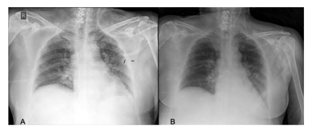
Fig. 2 Chest x-rays during the second and fourth postsurgical days. Chest x-rays taken during the second (A) and fourth (B) postsurgical days. The initial x-ray was ordered to check for the correct placement of the central venous catheter. The second x-ray was ordered to monitor the respiratory symptoms referred by the patient. Slight peripheral interstitial affection can be observed.