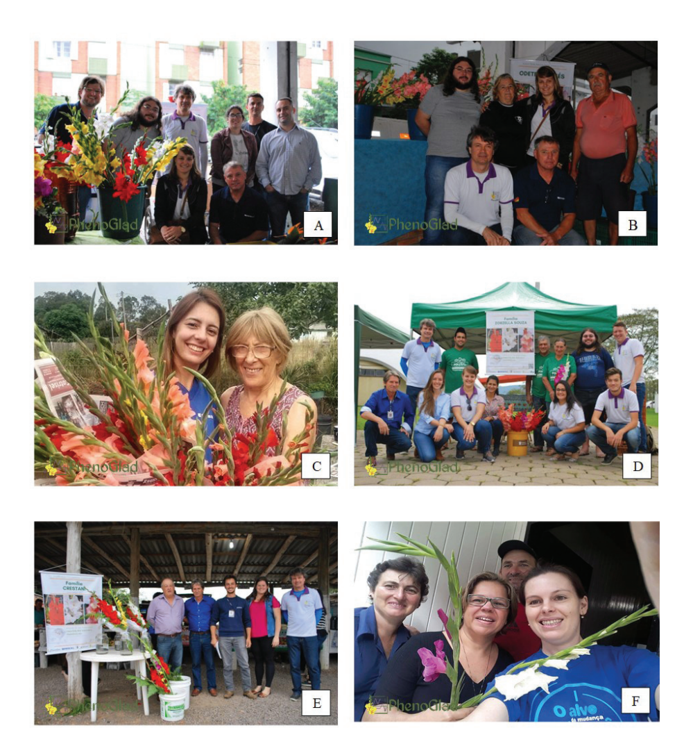
Figure 4. Commercialization of gladiolus floral stems for Mother's Day in the fairs in Cachoeira do Sul (A, B), Dilermando de Aguiar (C), Santa Maria (D), Santiago (E), and Nova Palma (F) counties, Rio Grande do Sul/Brazil.

As at local fairs the farmers do not have to follow the strict quality standards, the farmers were able to adopt strategies to commercialize all the production, including the smaller stems, by making packages containing a greater number of stems. The cost of production in each crop was approximate R$ 364.00 (US$91.00), including the purchase of corms, fertilizer, raffia wire for support and labor. As each farmer determined the sale price of the gladioli and the number of sold stems was not accurately accounted, it was not possible to determine the profit that each farmer obtained with their production.