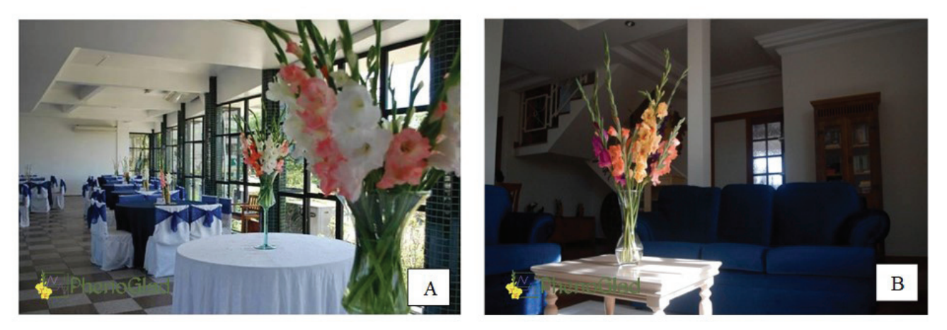
Figure 1. Different uses of gladiolus flowers stems: events ornamentation (A), and interior decoration (B).

The cultivation of gladiolus or Palma-de-Santa-Rita (Gladiolus x grandiflorus Hort.) has potential for expansion in RS, since it is easy to implant and manage, the crop adapts to the edaphoclimatic conditions of the state and can be cultivated in open field, reducing production costs, attractive features for the small family producer. In Brazil, All Souls' Day is the main date for the commercialization of gladiolus (Schwab et al., 2015a) and, because of this cultural factor, many farmers believe that cultivation of this species is possible only in late winter and early spring (July, August and September). However, the late summer and early autumn (February, March and April) is also a suitable period for the production of quality flower stems (Schwab et al., 2015b). In the RS, the demand for gladiolus has been increasing in different celebratory dates, such as Mother's Day, Women's Day and also for the ornamentation of interiors, parties and events (Schwab et al., 2018). These different forms of use as cut flowers are shown in Figure 1.