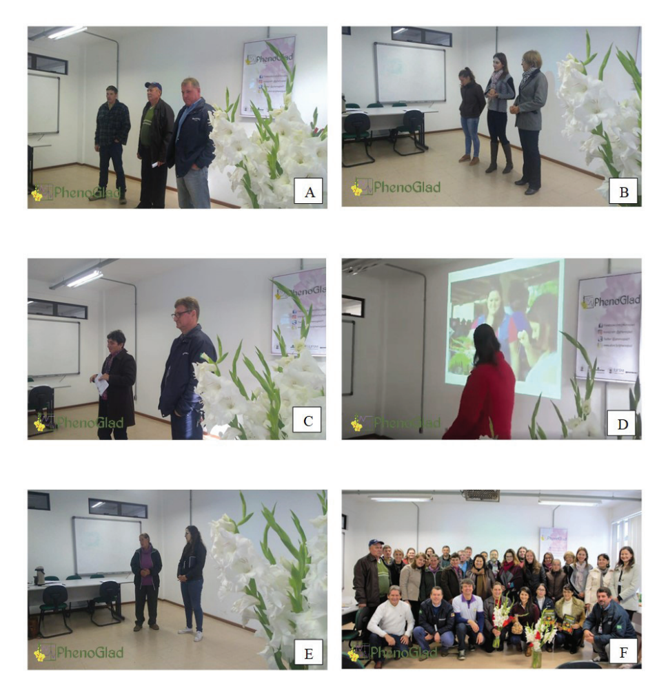
Figure 5. Evaluation technical meeting and planning of the next phase of the project with farmers and extension of EMATER-RS/ASCAR: reports of the extensionists and farmers of the Cachoeira do Sul, Dilermando de Aguiar, Nova Palma, Santiago, and Santa Maria cities, respectively (A, B, C, D and E) and farmers, extensionists and PhenoGlad Team (F).

This meeting also defined the project expansion, aiming the production of floral stems for the All Souls' Day in 2018, in the counties of Cachoeira do Sul (3 families and in an agricultural school), Dilermando de Aguiar (2 families), Nova Palma (1 family), Santiago (1 family), Santa Maria (1 family) and included in the project farmers of Itaara (2 families), Formigueiro (2 families), São João de Polêsine (2 families) and Júlio de Castilhos (in an agricultural school). This project showed scope beyond the Central Depression of RS, with potential for expansion to other regions of the state.