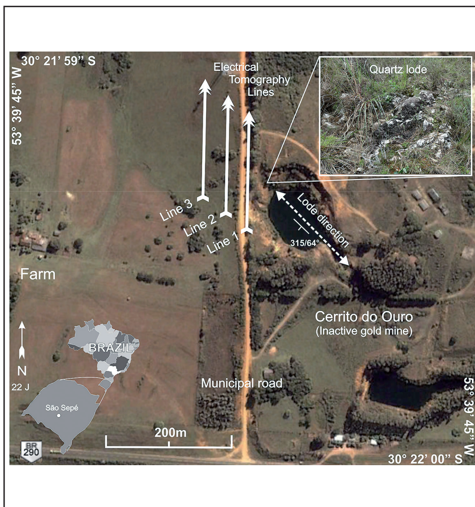
Figure 1 Electrical tomography lines, with orientation and detail of the gold lode.

The measurements acquired in the field were processed in the Res2dinv program and resulted in sections of resistivity in terms of distance x depth, with a logarithmic graphic scale and interpolation intervals of values in colors. This is a program that automatically determines a two-dimensional model of subsurface, from resistivity or chargeability data acquired in electrical routing essays (Loke and Barker, 1996).