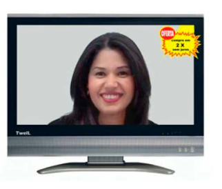
Figure 2. Neutral, false and genuine facial expressions, respectively