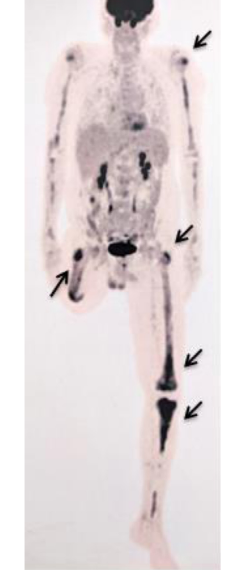
Figure 1 - {}_{18} FFDG-PET Scan with bone inflammatory lesions (black arrows).

We diagnosed ECD after PET-CT and biopsy from femur only after bone pain onset, very significant weight loss, and unexplainable increase of platelets. This uncommon association between myeloproliferative disorders and ECD brings low overall survival. Very recently, a study with 89 ECD