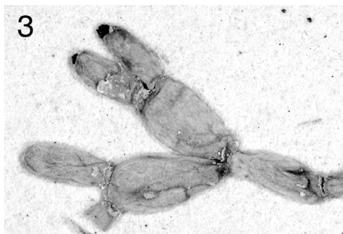
Fig. 3 – Close-up of portion of lectotype specimen.