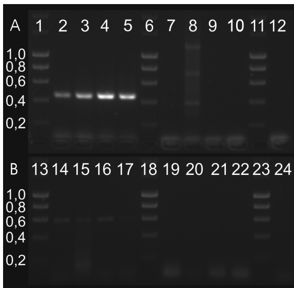
Fig. 2 – A , RT-PCR analyses detecting SmcGK1 transcripts of the expected size (452 bp) in pairing-experienced females (ef; lane 2); pairing-unexperienced females (uf; 3); pairing-experienced males (em; 4); pairing-unexperienced males (um; 5). Controls: ef RT-negative (RT - ; 7); uf RT - (8); RT without template (9); em RT - (10); um RT - (12). The unspecific products in lane 8 originated from residual amounts of DNA. Marker: Hyperladder I (Biolone, Germany; sizes given in kb), lanes 1, 6, 11, 13, 18, 23. B , strand-specific RT-PCR analyses confirming the existence of antisense products (609 bp) in ef (14), uf (15), em (16), and um (17). Controls (lanes 19-22, 24) as in A.

To confirm the presence of SmcGK1 in all adult life stages of Schistosoma mansoni RT-PCR reactions were performed with RNAs from pairing-experienced females (ef), pairing-unexperienced females (uf) obtained from hamster infections with unisexual cercariae, pairing-experienced (em) and pairing-unexperienced males (um) obtained in the same way. SmcGK1-specific products were confirmed in all adult stages (Fig. 2A). Control reactions for DNA contamination lacking the enzyme during reverse transcription reactions (RT - ) did not detect DNA in ef, em or um, but in uf, however, the resulting PCR products were unspecific.