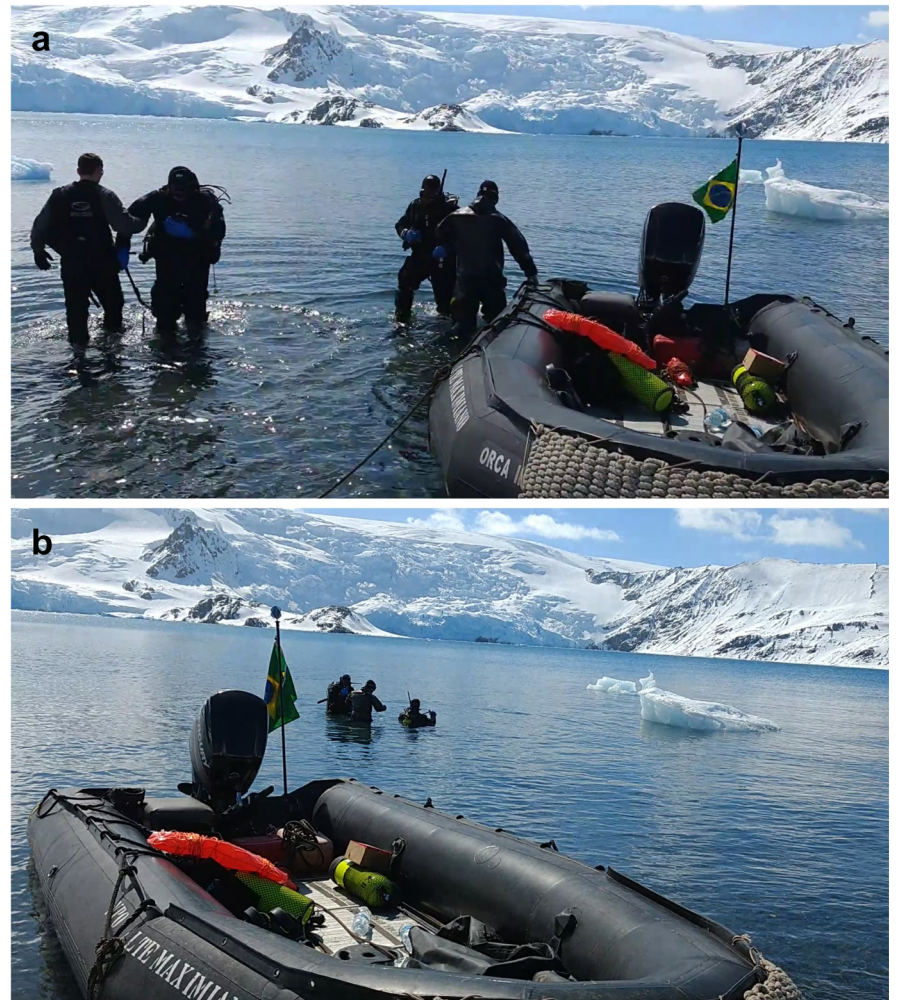
Figure 1. Divers entering the icy waters in Antarctica. The moment when the Supporting group helped the divers to enter the water (a), and the moment immediately before submersion in the water (b).

The effects of a dive in Rio de Janeiro (n=2 divers) were also evaluated, using similar procedures to those used in Antarctica. Physical characteristics of divers (one of whom also dived in Antarctica) and additional data are presented as Supplementary Material (Tables SI-SV). The measures were conducted at baseline (on the ship, 09:00 h; ambient temperature of 20.0° C and 40% RH), pre-dive (field, 11:00 h; 28.0° C and 68% RH), and post-dive (on the ship, noon; 29.0°