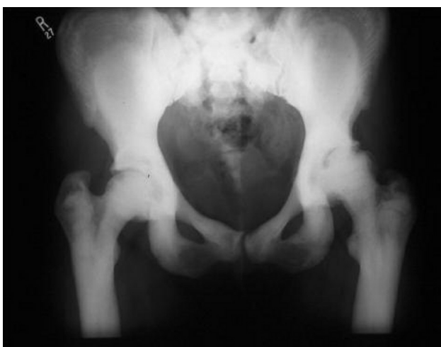
Figure 2. X-ray of pelvis in a patient with osteopetrosis. Note the increased radiodensity of bone and disordered microarchitecture of cortical and cancellous bone.

Bone exposed to fluoride provides an example of a qualitative abnormality of bone mineral that is associated with reduced bone strength. The size and composition of hydroxyapatite crystals is changed as a result of substitution of the hydroxyl group of hydroxyapatite by fluoride; in addition, there may be accumulation of osteoid and the formation of woven bone (12).