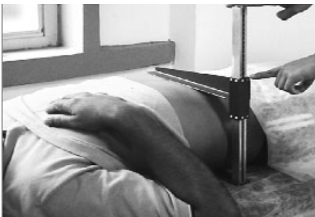
Figure 1. Sagittal abdominal diameter.

The area of abdominal fat was measured by CT of the abdomen, performed by a radiologist, using a PQ5000 Picker Tomograph at the Radiology Service of the Fundação Baiana de Cardiologia. The exams were done after 4 hours of complete fasting with the patient in supine position and arms extended above the head. A lateral tomogram was done to precisely locate L4-L5, and then a single axial tomographic slice was performed in this location, with a slice thickness of 10 mm. Neither oral nor intravenous contrast was administered. The preselected attenuation interval chosen for fat was -50 to -150 Hounsfield units (17). The area of subcutaneous abdominal fat (SAF) was calculated by subtracting the area of visceral area of abdominal fat (VAF) from the area of total of abdominal fat (TAF). The CT and anthropometry were done in the same week.