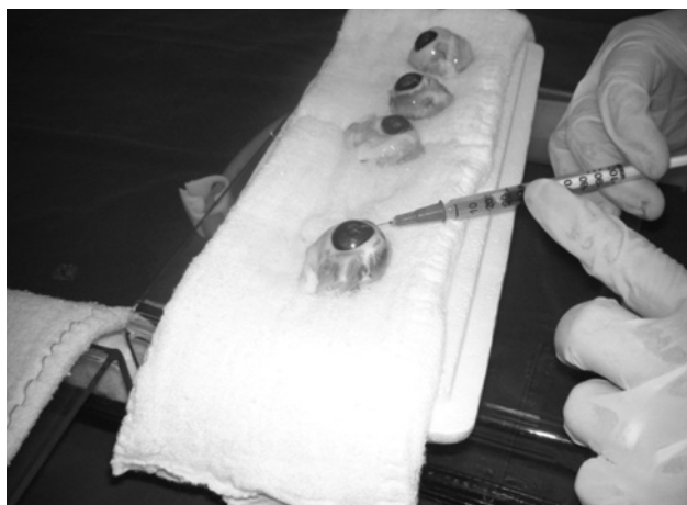
Figure 1. Contamination of pig eyes.

After each surgery, surgical drapes and the operated eye were removed; the tip, the bag used to collect the phaco fluids and all of the instruments used during surgery (e.g., forceps, needles, syringes, gloves and 2.75 mm scalpels) were exchanged. The new eye to be operated upon was placed in the new operative field, and only the handpiece used for phacoemulsification, without the tip, and the irrigation and aspiration tubing remained.