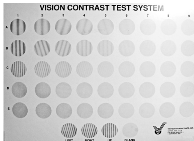
Figure 1. FACT sine-wave grating chart tests five spatial frequencies (sizes) and nine levels of contrast. The patient determines the last grating seen for each row (A, B, C, D and E) and reports the orientation of the grating: right, up or left. The last correct grating seen for each spatial frequency is plotted on a contrast sensitivity curve.

It refers to the temporary loss of visual function in the presence of a bright adjacent light source. Common sources of disability glare for